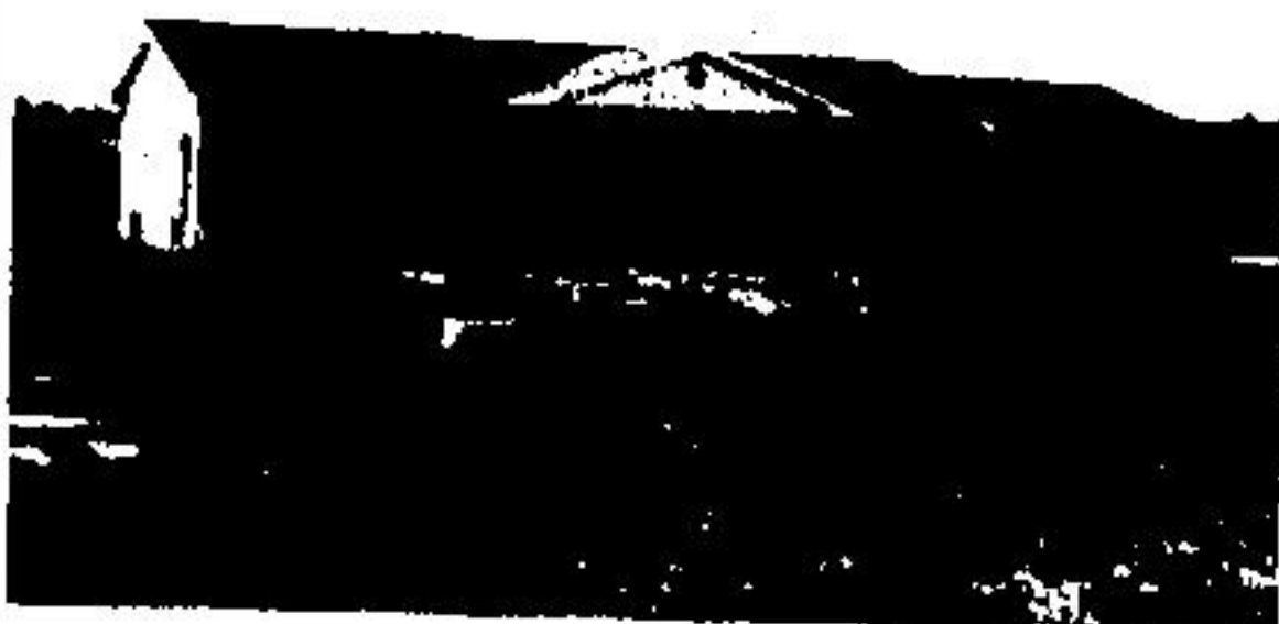
Rambling Rancher $84,500

FOBERT H. FOBERT REAL ESTATE LTD. 22 Ontario St. S. Milton (Across from Plaza)