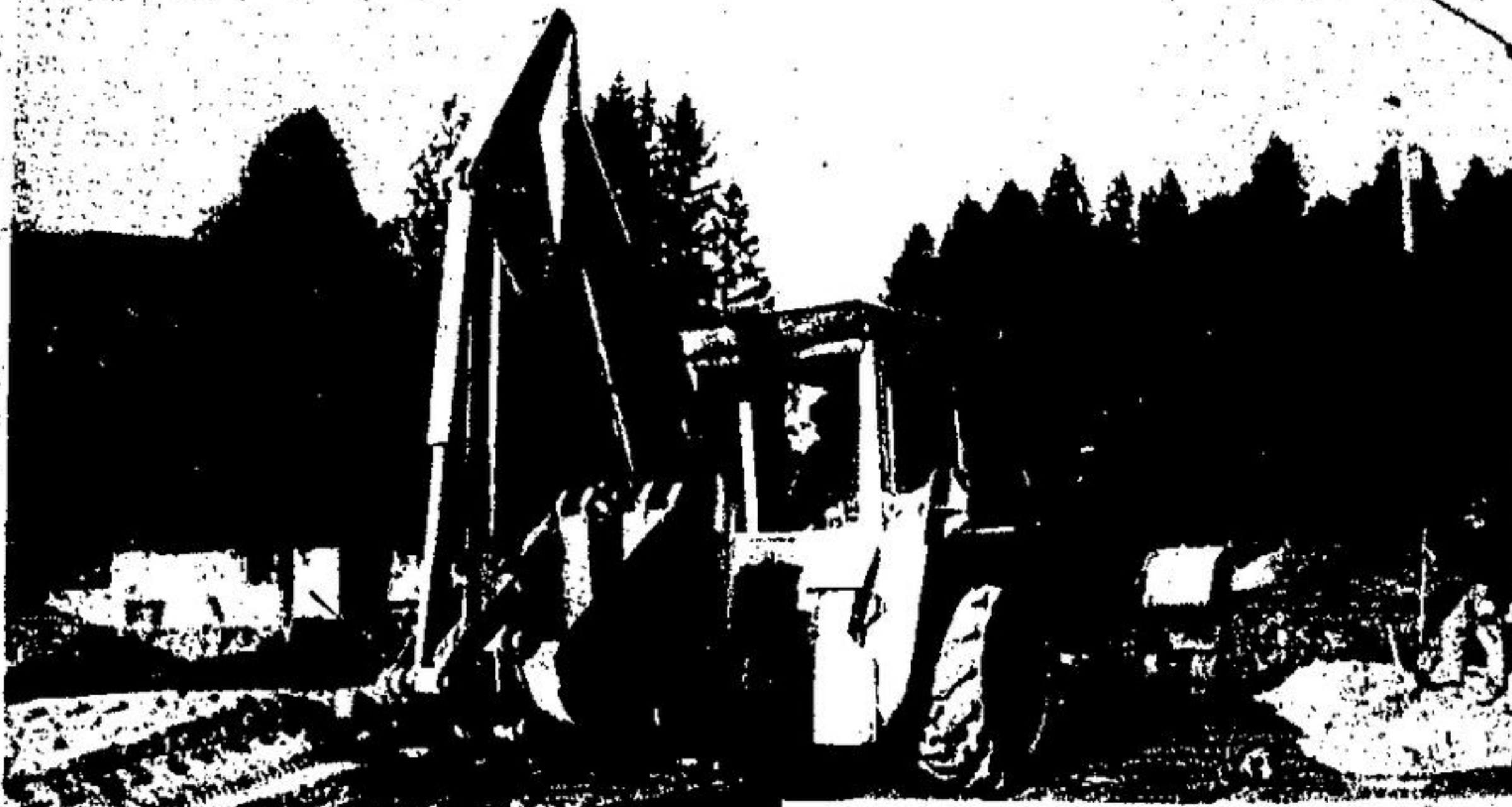
CORNER OF MILL W. and Cobblehill Rd. is getting a facelift as its part of the road improvement program, currently underway. New ditches and culverts will make the road ready for heavier traffic, due to Kingham Hills subdivision.

Halton Hills works committee is in Acton today checking out a few problems which came up at their Monday night meeting.