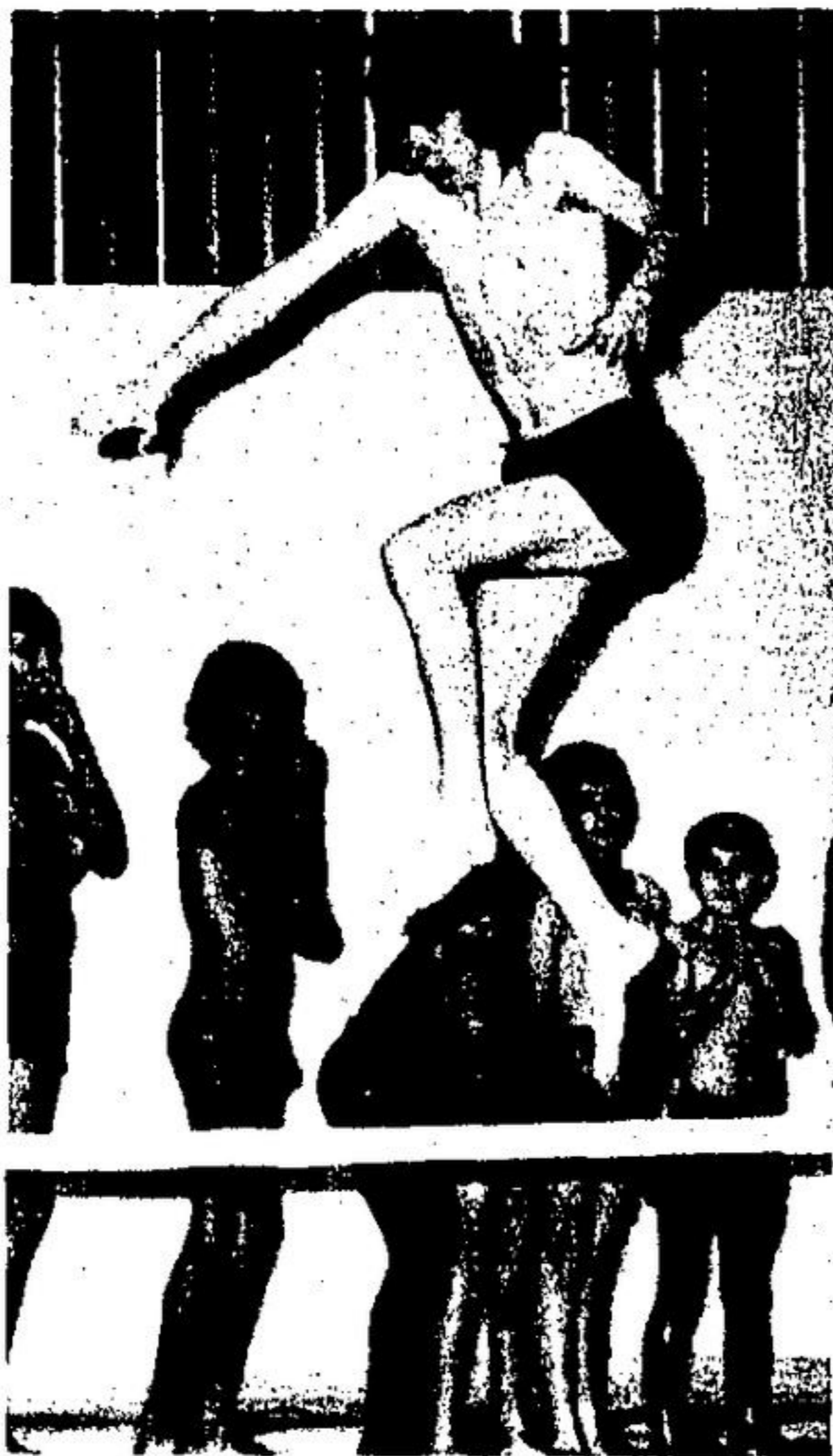
OOHHH! That looks cold! Various diving styles were demonstrated during public swimming hours Saturday, Sunday and Monday at the new pool.