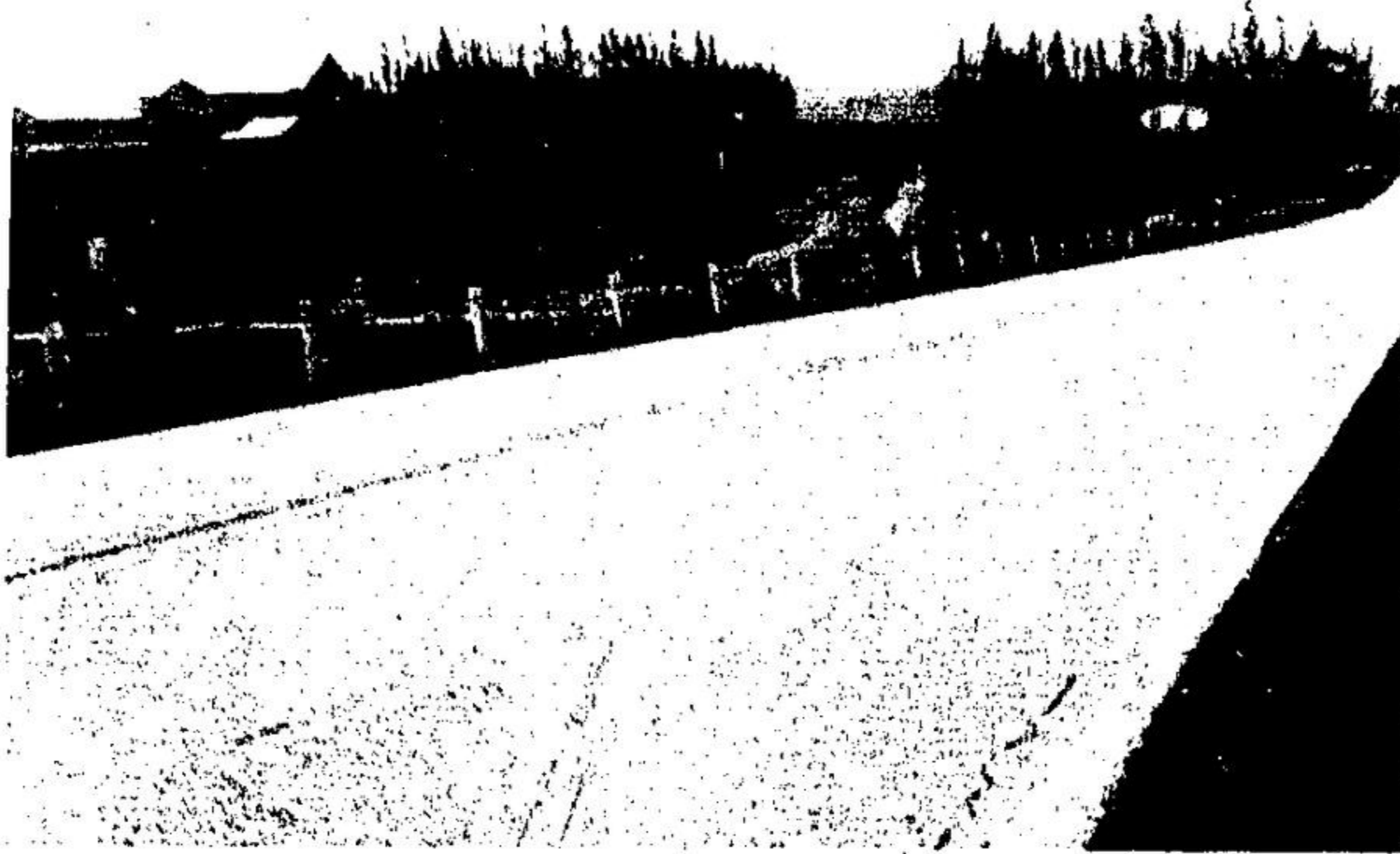
THE NEW GUELPH dam being built by the Grand River Conservation Authority is well under construction, with cement base now poured. Travellers on Highway 24, nearing the boundary of Eramosa and Guelph townships, can see under construction, a smaller dam over which Highway 24 will be diverted.