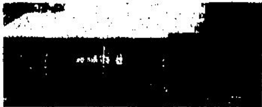
SUBTLE ELEGANCE —Stylish 3 bedroom bungalow, superb family area, fireplace, broadloom. Attached garage. Only $62,900.