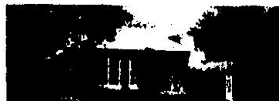
SACRIFICE —Sharp 3 bedroom brick side split, desirable area, family room, acorn fireplace. Hurry $59,500.

DON'T MISS THIS ONE —Half acre treed lot on paved road, six room bungalow, three bedrooms, needs decorating and broadloom. Great opportunity $49,900.