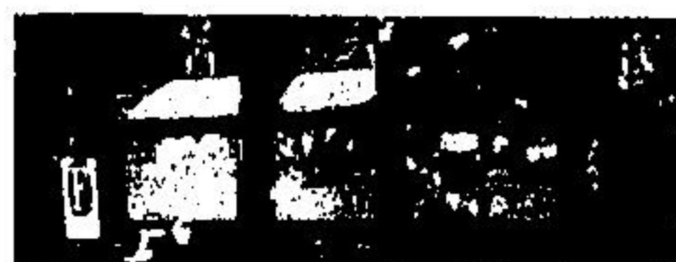
PRACTICAL SOLUTION —Two bedroom bungalow, aluminum siding, large treed country lot. Now only $28,900.

LIKE LARGE ROOMS? Then you can't miss with this brand new 3 bedroom sidesplit on 70 ft. lot in town and just minutes from plaza. Other features: walkout family room with fireplace, 2 extra washrooms, garage and priced way down for fast sale at $63,500.