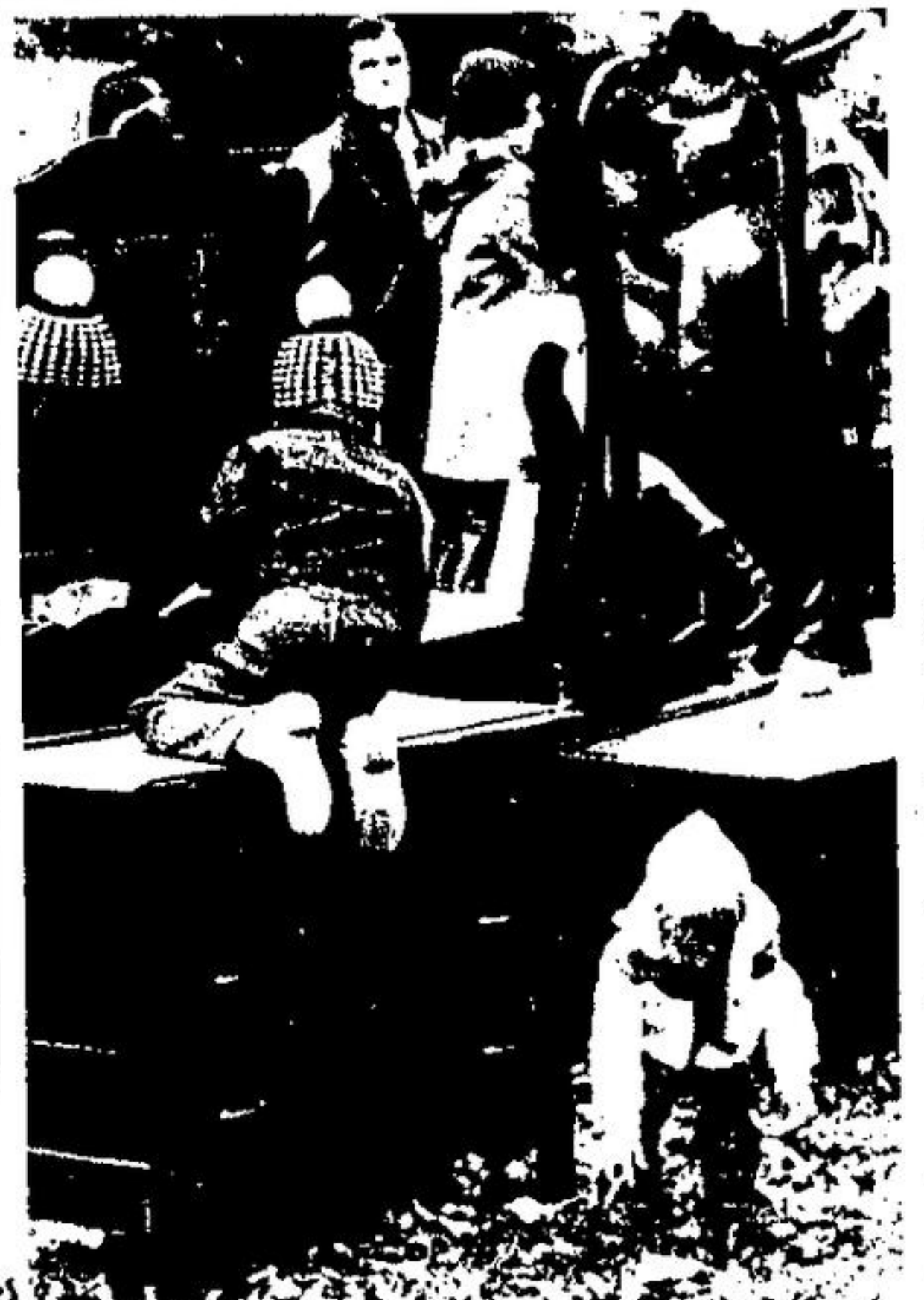
THERE'S LOTS of entertainment at auction sales. Little ones can always explore, or work on a leaf collection.