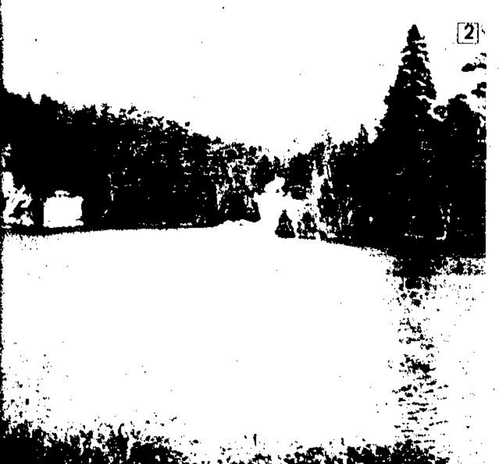
Area, penned up by a large dam before slicing through more rocks on its way to Eden Mills.