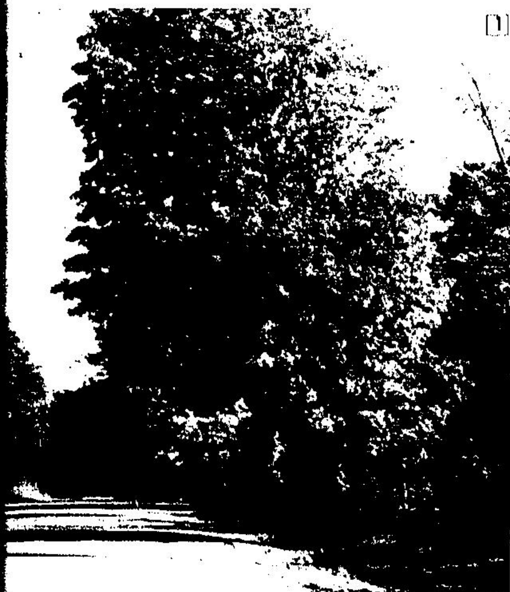
Rockwood Conservation Area is flanked by the Valley Road adjoining the river, and Eden Mills, producers of high quality