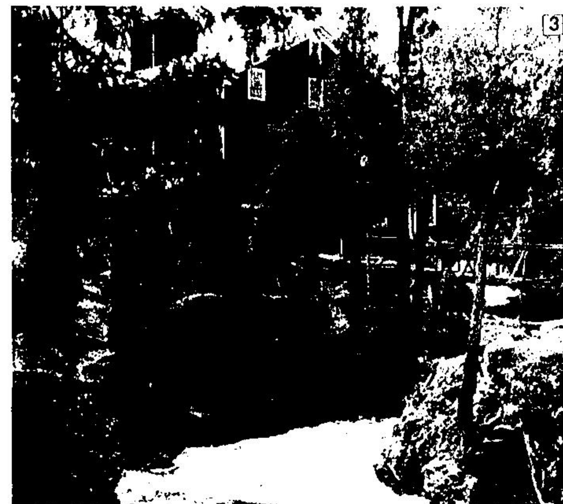
THE ERAMOSA races madly through a small gorge at Everton topped by an old grist mill which ran by water power. The river is a tributary of the Grand River system.

Continue to Speyside and you are back where you started. The 40 mile trip can be done easily in a couple of hours or could be stretched into a full day's outing.