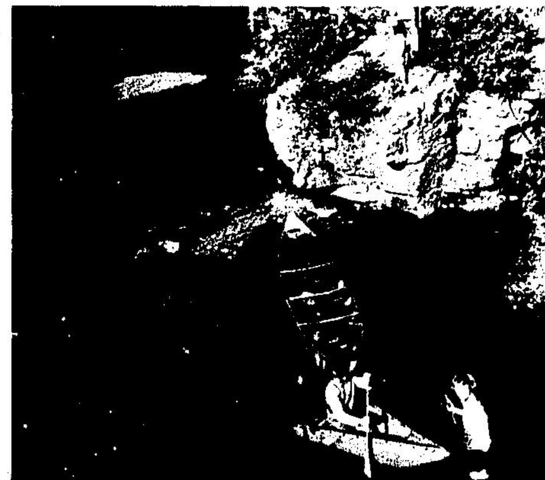
ROCKWOOD CONSERVATION Area is like a piece of transplanted Muskoka. It contains some unique geological formations left by the ice age.