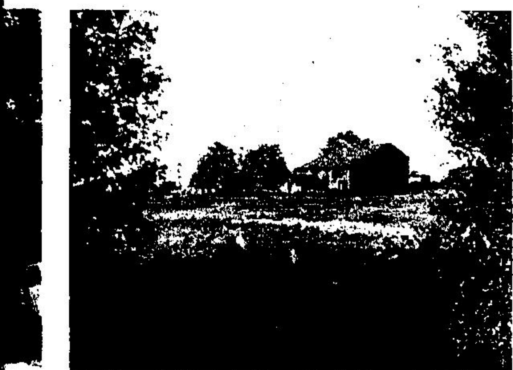
Picturesque farms dot the countryside