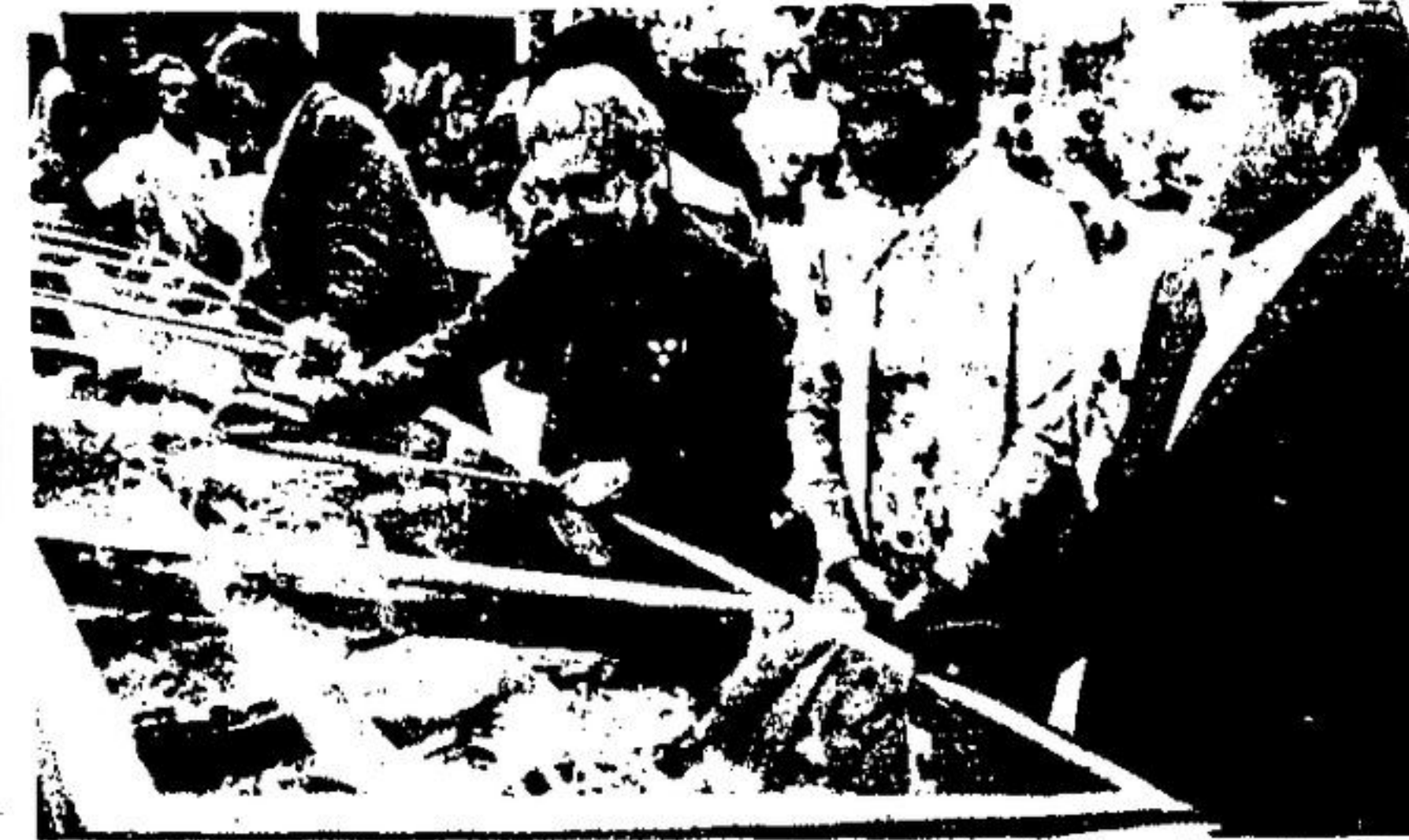
HALL EXHIBITS drew constant crowds. New competitors joined old to keep entries up in homemaking classes.