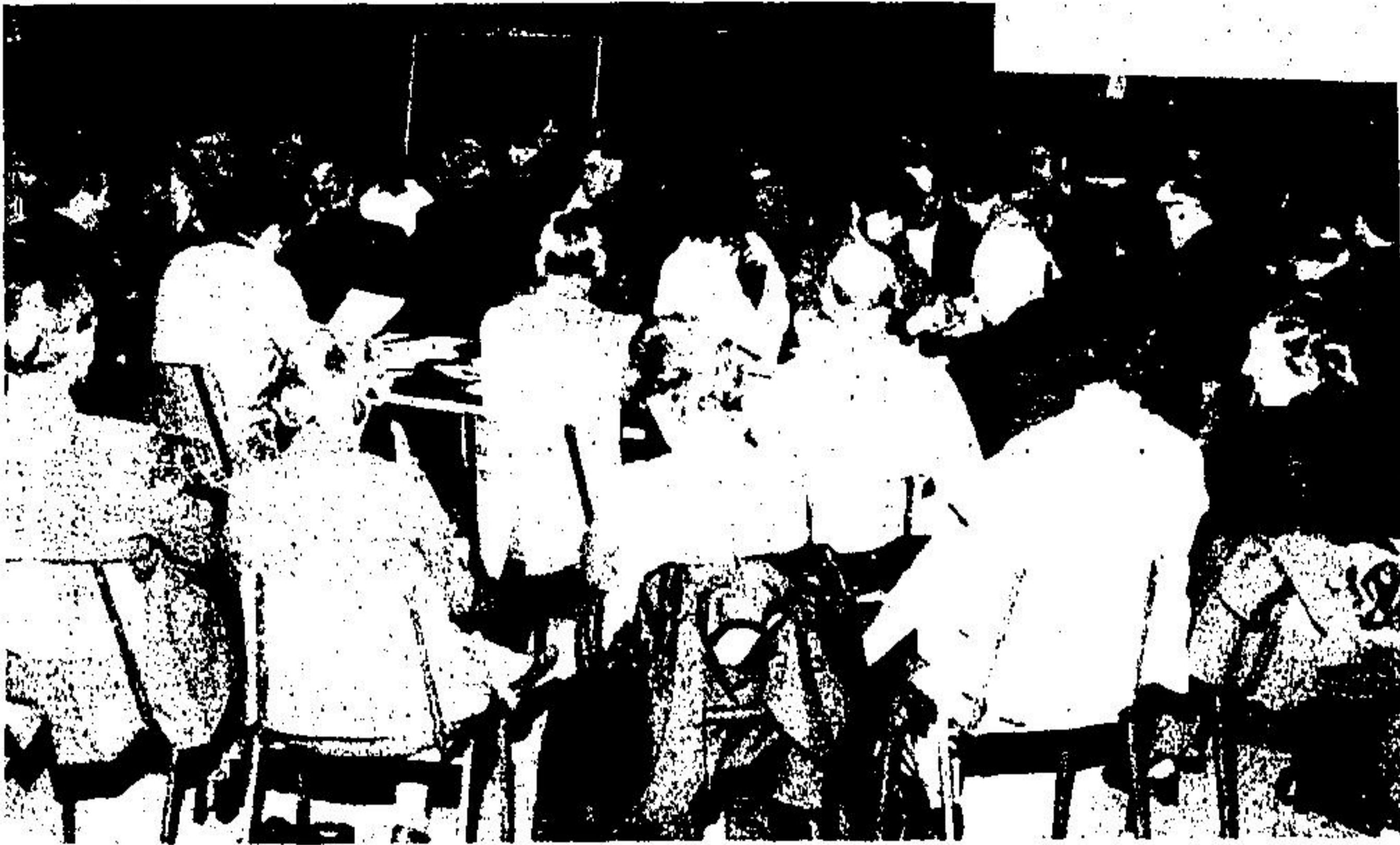
THE HALTON COMMITTEE has been at work for several years preparing for this year's big International Plowing Match Sept. 24 to 28. Activity has picked up this past year though, and there were 100 people at the last planning meeting in Master Feeds' auditorium north of Hornby. Above, part of the crowd at a recent meeting.