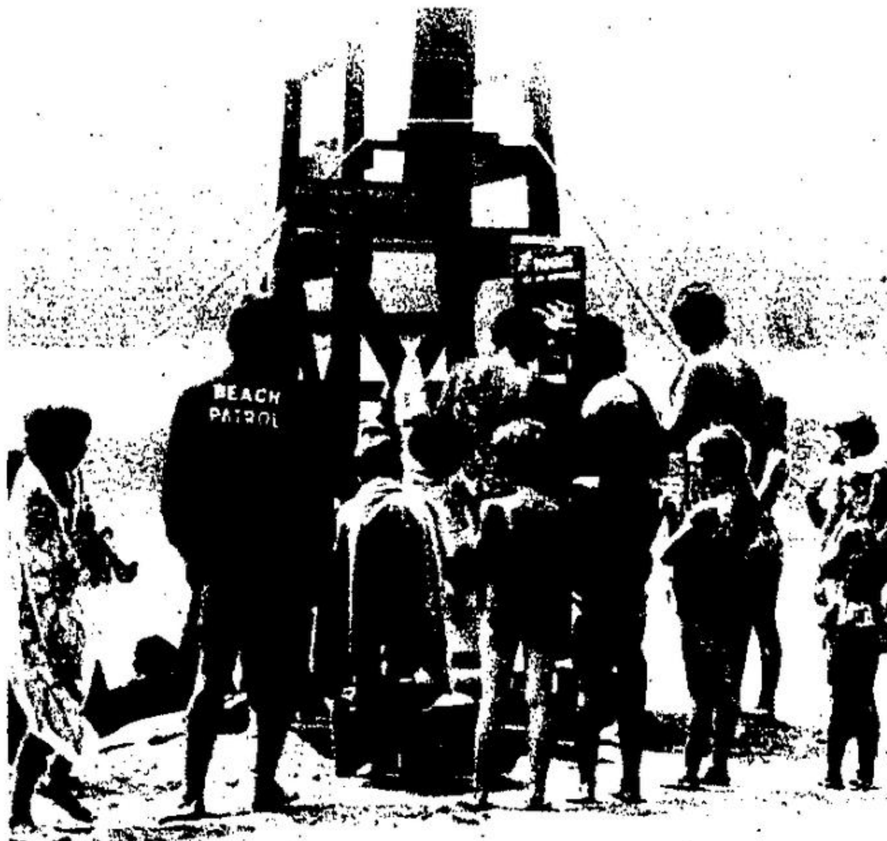
INSTRUCTORS AND instructees gather at the life-guard stand at Rockwood's conservation park beach to talk over procedures and what the next classes are all about. About 85 students are registered for the park courses, ranging in age from two to 15 years. The program has the "no such word as fail" approach and the children work and play in the water with their own speed registering accomplishment.