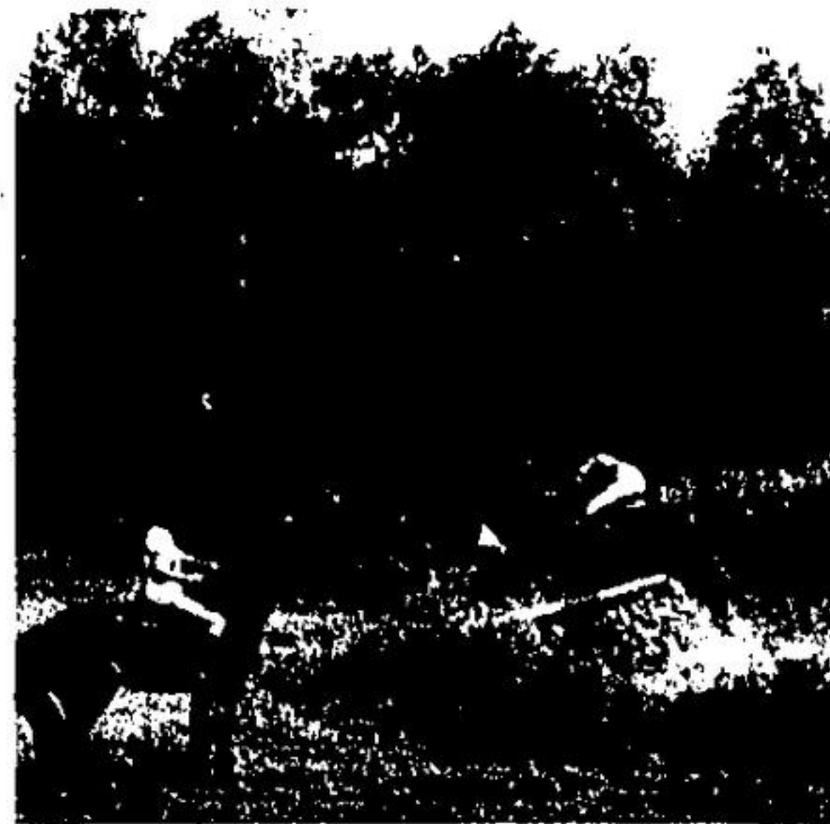
COUNTRY-SIDE surrounding Mohawk Raceway provided many interesting trails and jumps for the Western Ontario Regional Pony Club Rally last week.