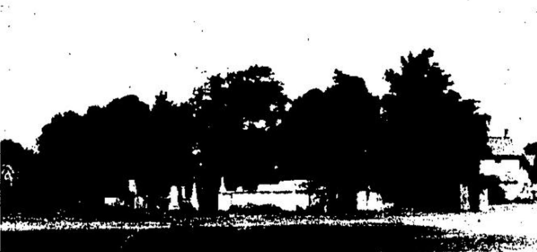
SLOWLY BUT SURELY the tennis courts behind the community centre are progressing. This week the pavement has been laid and for the time, is being used by young cyclists practising their skills.

Campbellville seniors were subjected to a merciless trouncing by the Leaside Maple Leafs in Campbellville Sunday afternoon. The league leading Leaside squad thumped the locals 22-1 in what was probably the worst defeat in Campbellville baseball history.