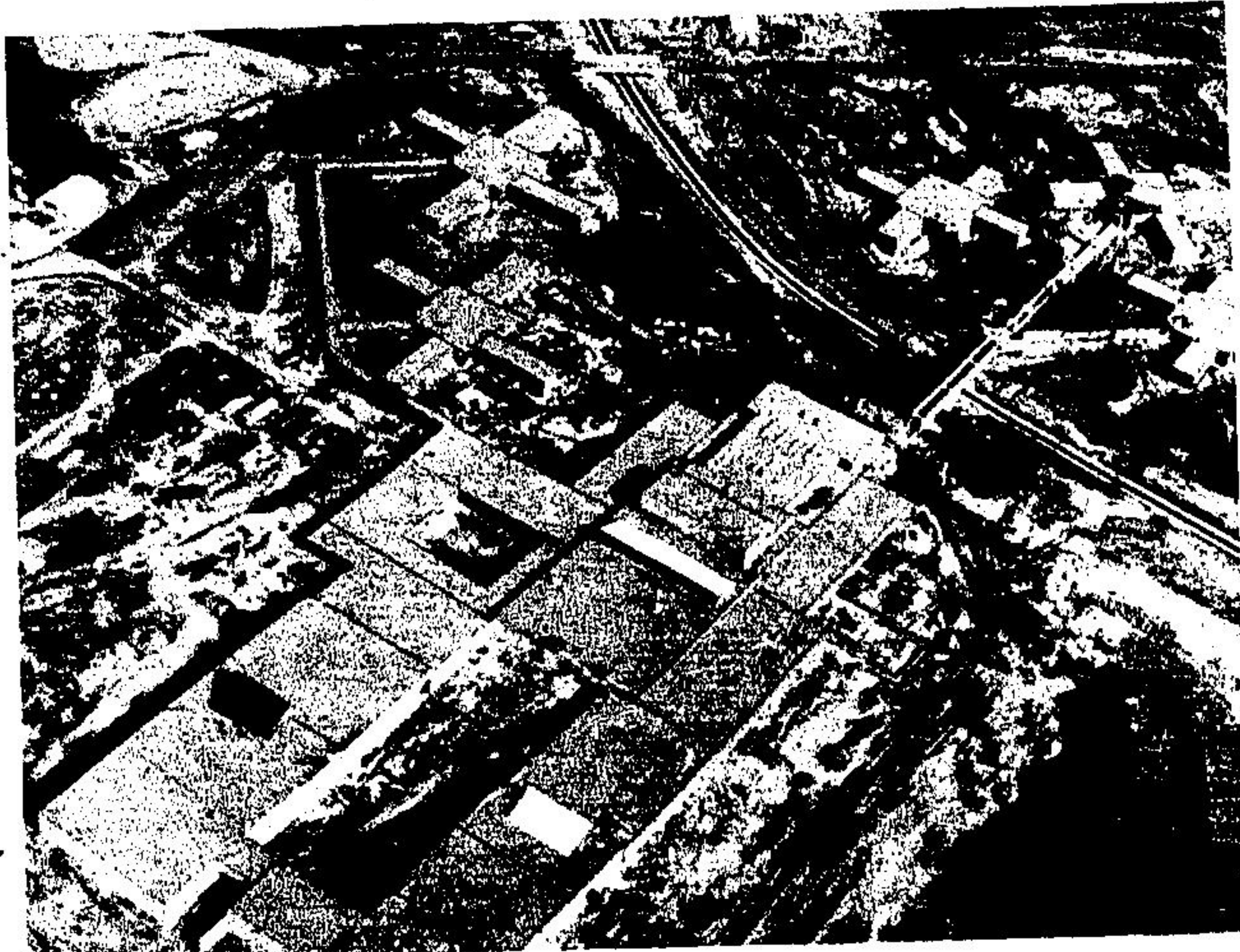
MAPLEHURST CORRECTIONAL CENTRE new provincial jail now under construction! Highway 401 in Milton, is slated for opening in 1975. It will house 400 and will cost $13,500,000. The building in the foreground is the vocational academic training area. Inmates will live in dormitory-type residences pictured at the top photo.