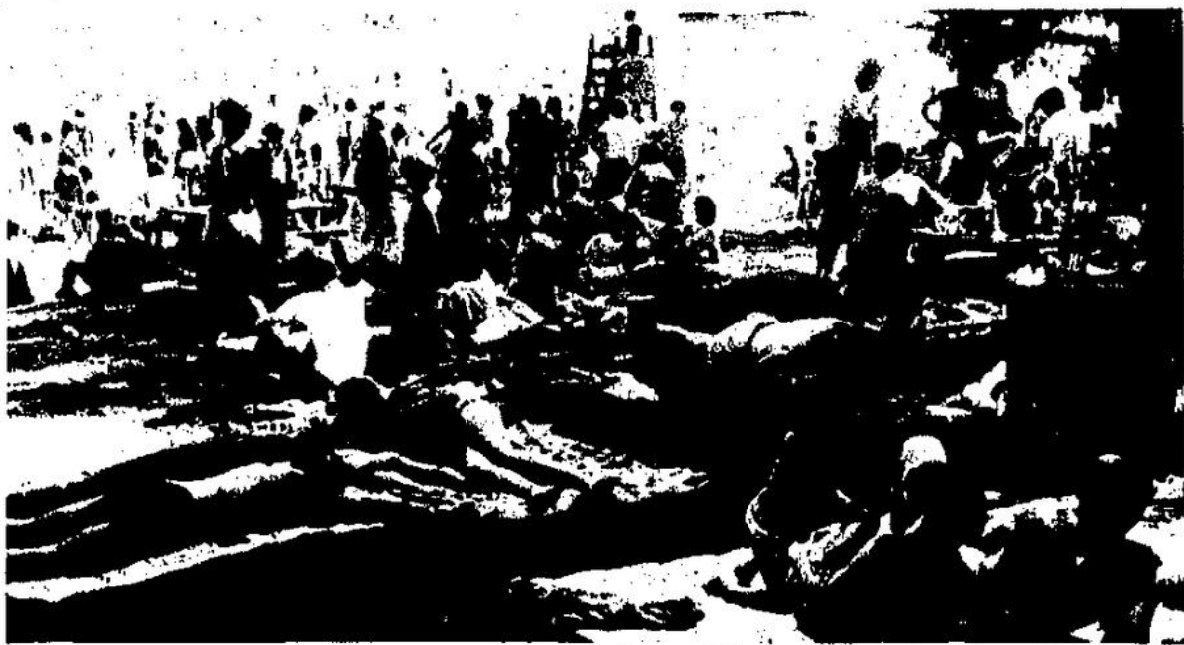
ROCKWOOD BEACH was jammed to capacity Sunday as picnic groups, campers and day visitors left the city heat to find relief on the country shores. Lifeguards were kept busy keeping eyes peeled on myriads of bathers while others lay about the beach capturing rays of summer sun.

Telephones lines continue to ring these days as many people are too far from home to answer. A happy holiday to everyone but how about calling in when you get home and tell us where you've been.