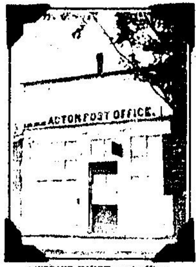
ACTON'S FIRST post office building, on Mill St.