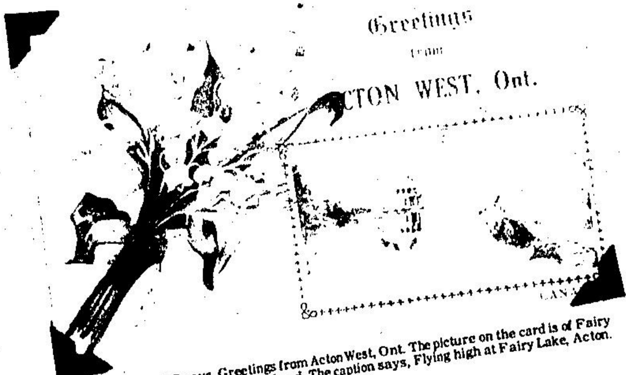
THIS POSTCARD says, Greetings from Acton West, Ont. The picture on the card is of Fairy Lake with an airplane flying overhead. The caption says, Flying high at Fairy Lake, Acton.