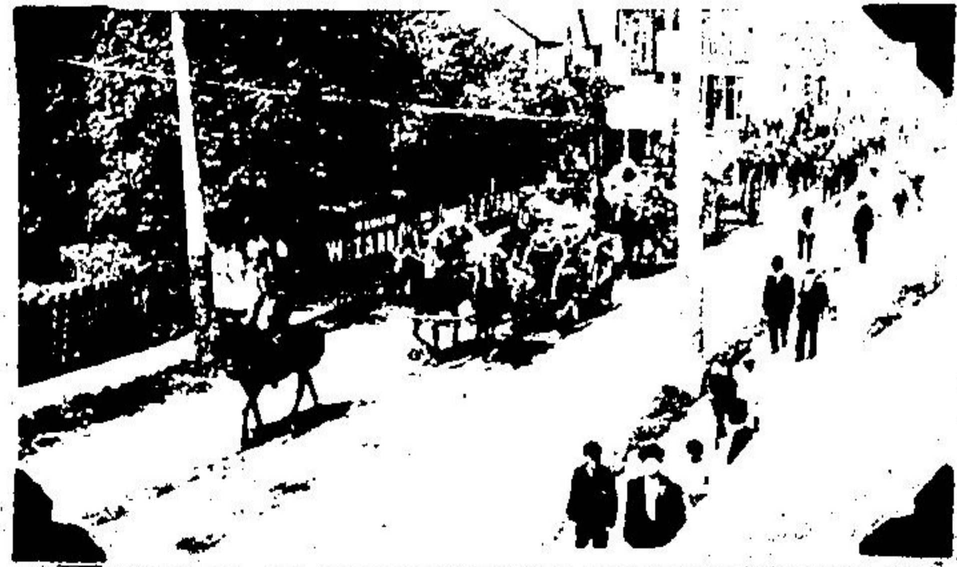
FIRST OF JULY parade comes down Mill in 1904 as spectators watch from the wooden sidewalks. The head of the parade is passing Mrs. Secord's garden, where A & B Supermarket is now.