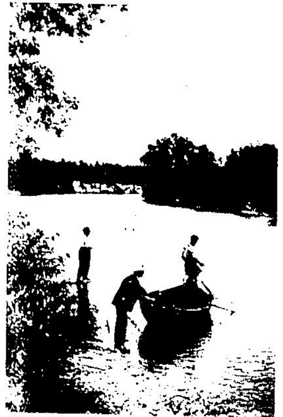
FISHING IN The Big Pond—later called Fairy Lake. This photograph was taken in 1897.