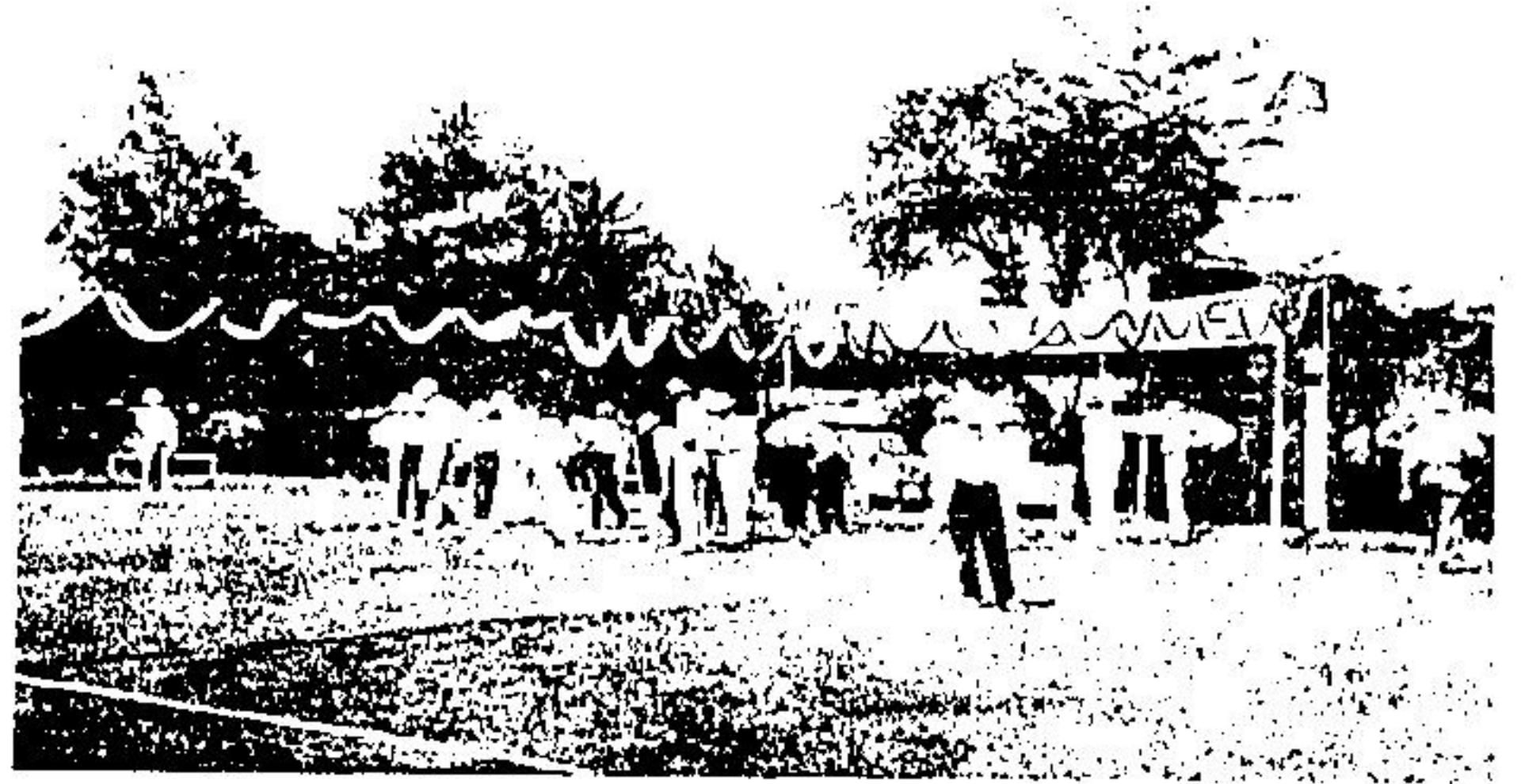
rowing Green, Acton, Ont.