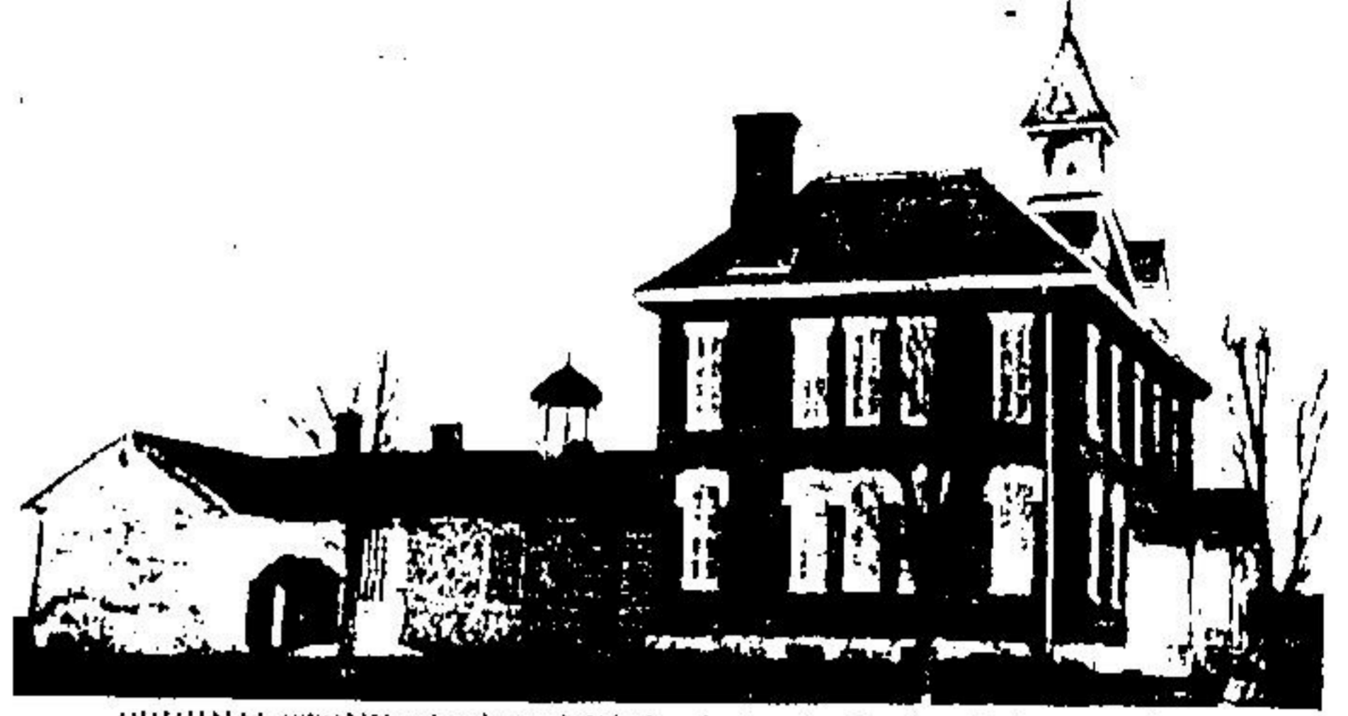
ORIGINAL STONE school was left behind when fine brick addition was added