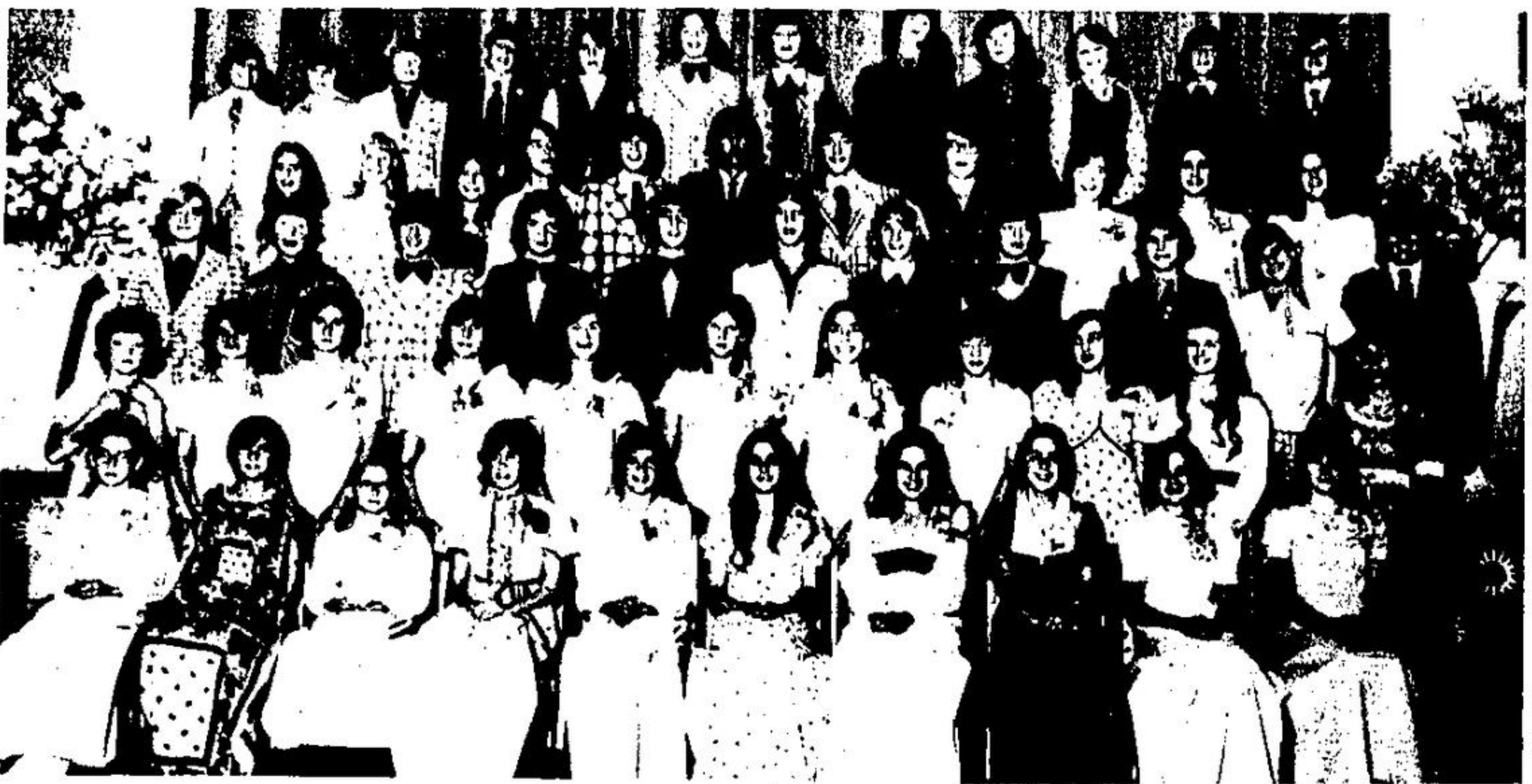
M. Z. Bennett school graduates group photograph