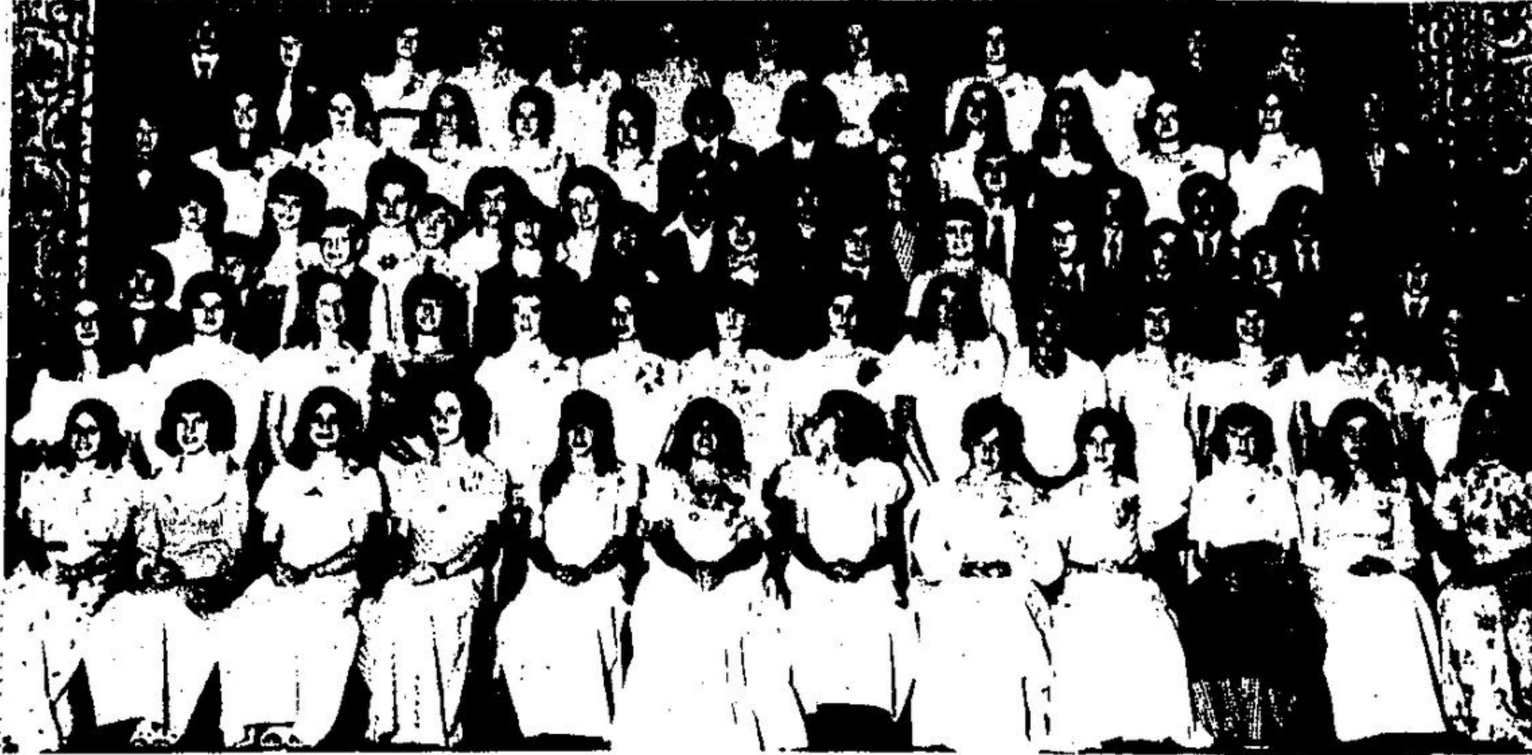
Grade eight graduates of the Robert Little school