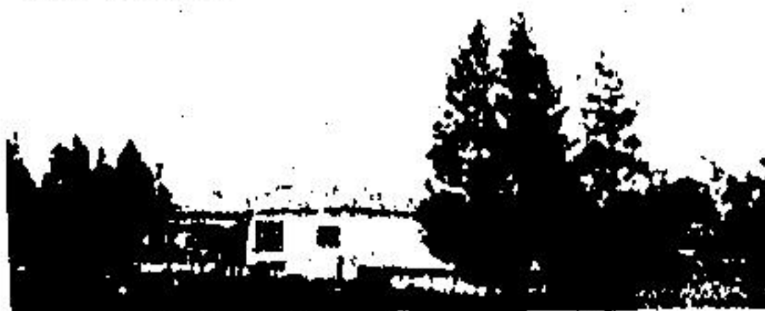
$66,900 1/2 ACRE

3 bedroom side-splitt. Rec room with bar, fireplace, 2 bathrooms, broadloom, washer, dryer. Home in show-room condition.