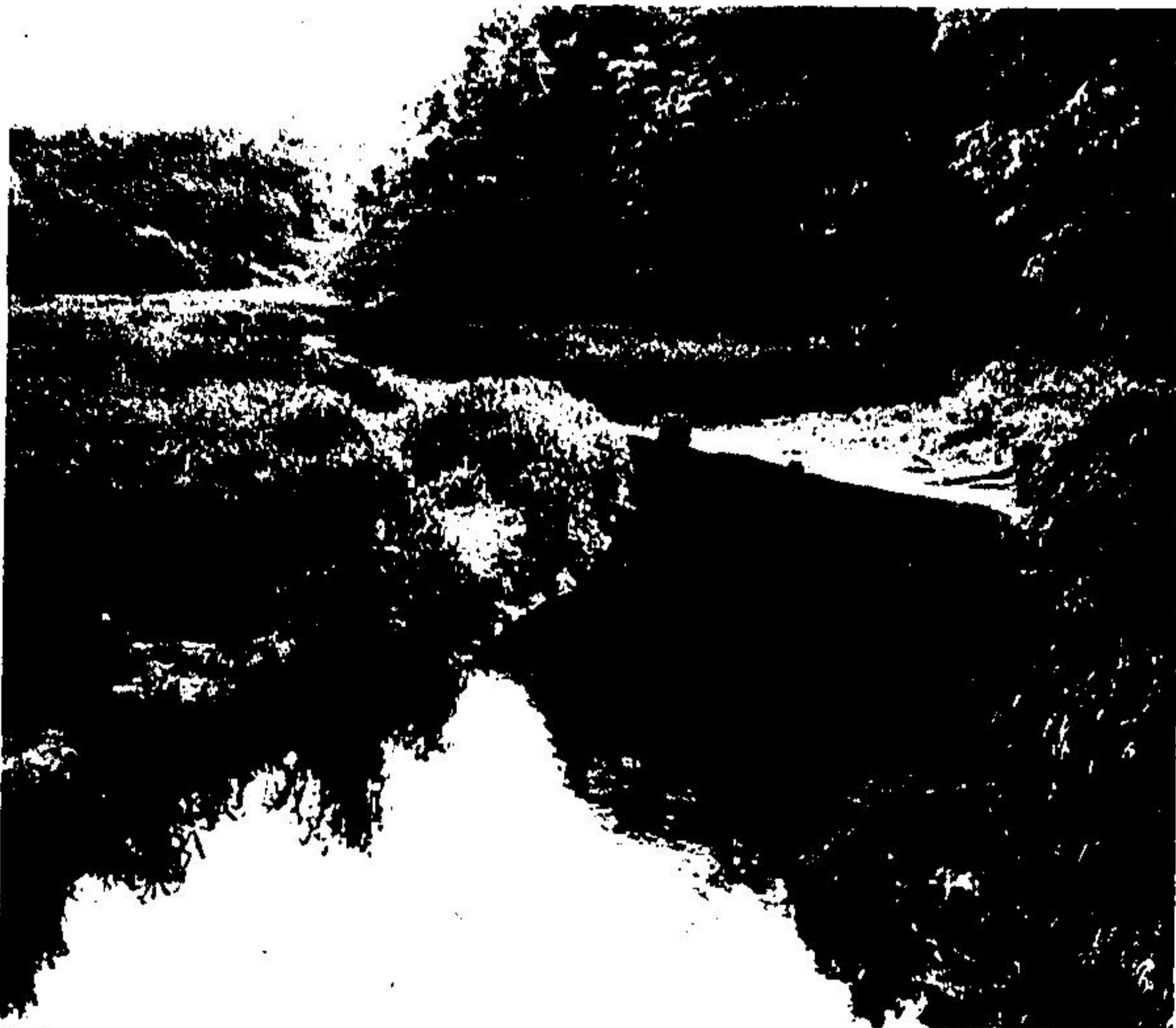
The Black Creek lies solemn and still just above the lime kilns at Limehouse.