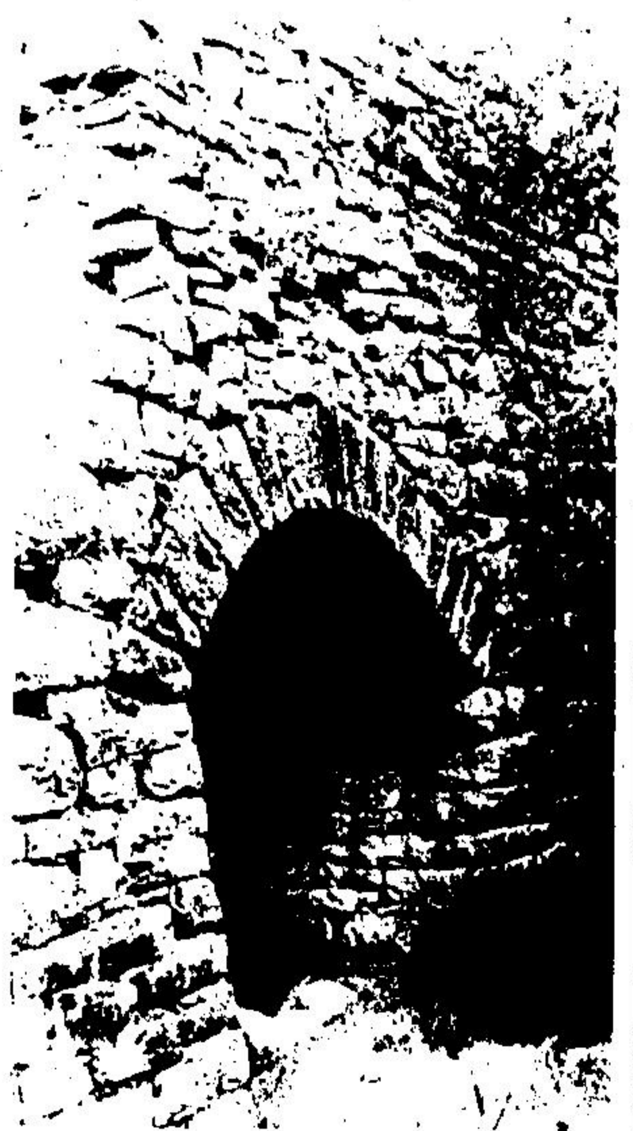
An empty lime kiln opens on the ground level near Limehouse. The opening to the top of the kiln is blocked through years of neglect.