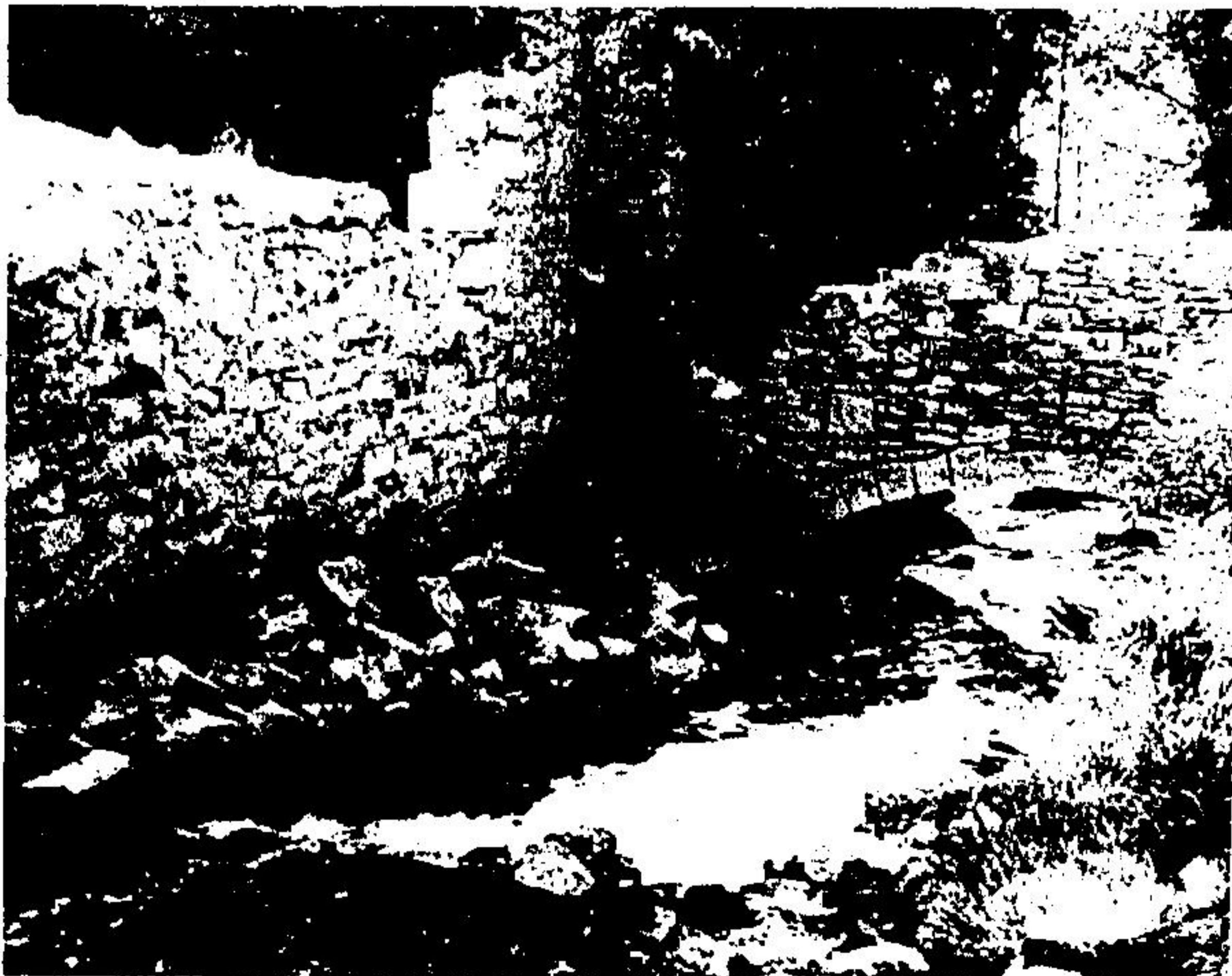
Tumbling down through the ruins of an old mill is the Black Creek. This was probably one of the buildings used in the limestone refining operation near Limehouse.