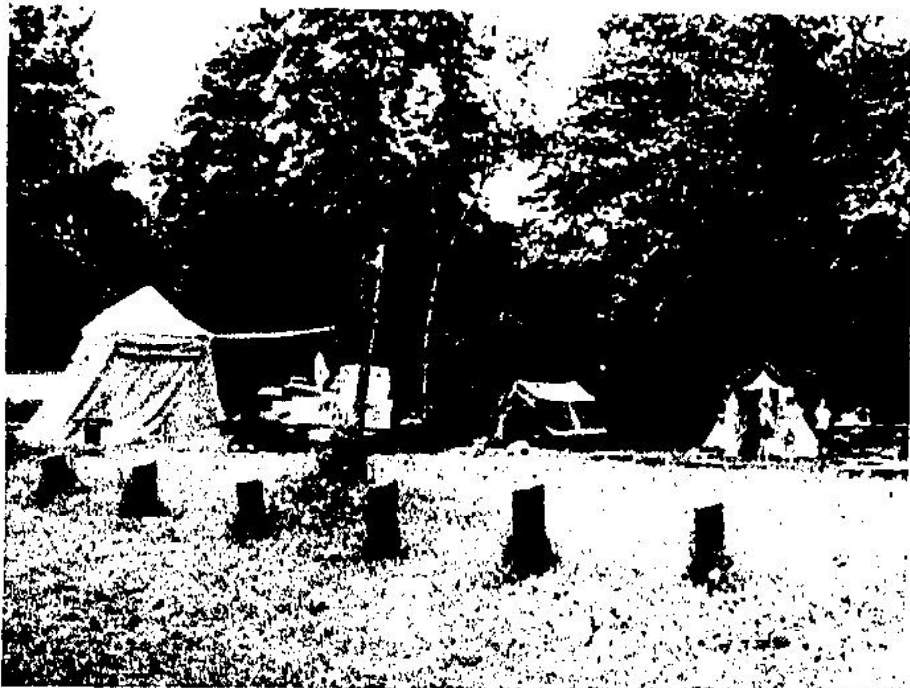
Campgrounds are open at Kelso for group camping for those who enjoy the outdoors living.