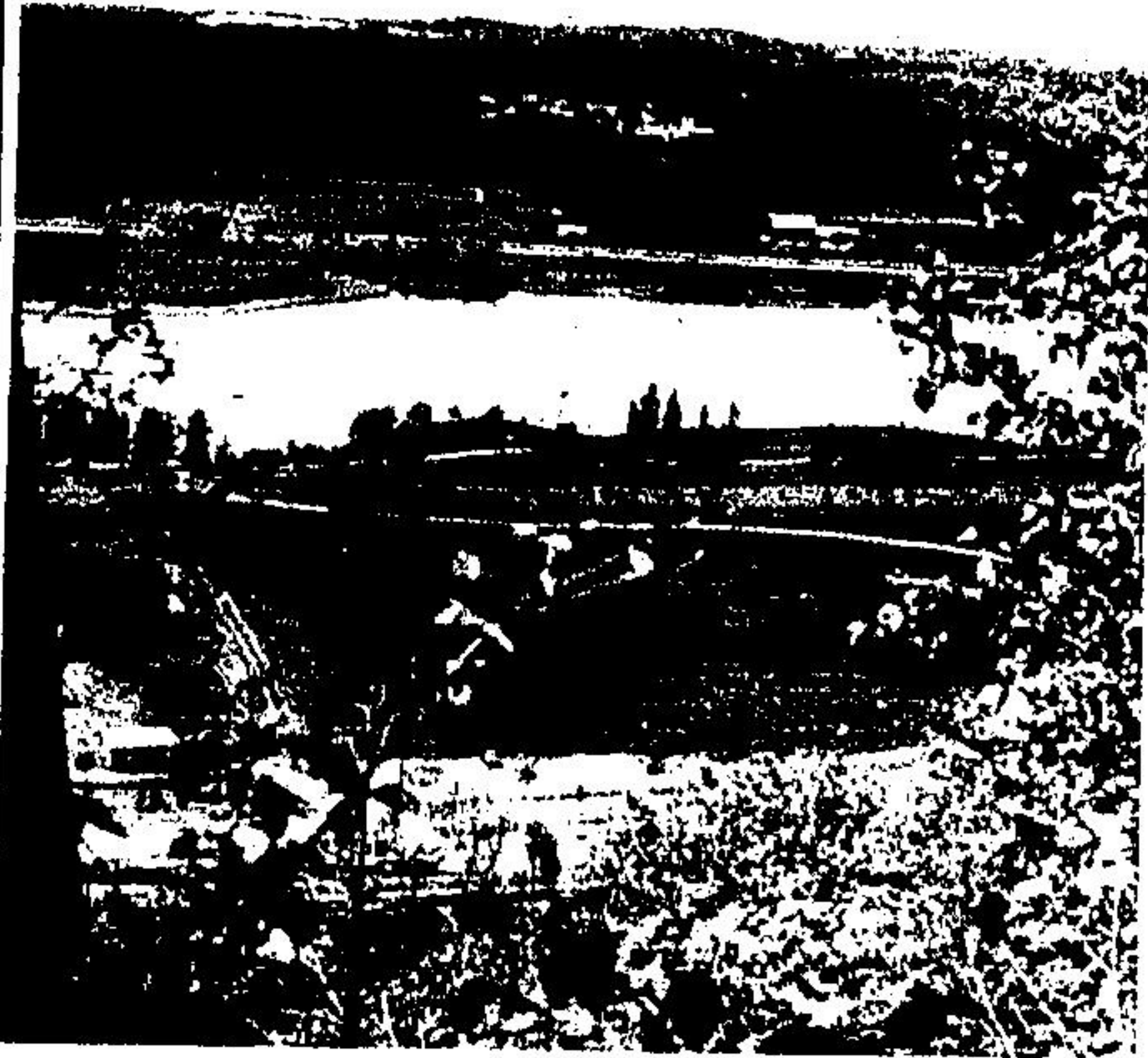
Highway 401 cuts across the centre of the picture with Kelso Lake and grounds in the foreground as seen from high on the escarpment.