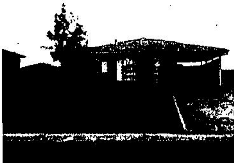
BACK SPLIT OF FANTASTIC BEAUTY —Small town atmosphere for your family accompanying this 3 bedroom home comes with a fully fenced yard with the most beautiful finished basement with extra full bath. The whole home is just newly decorated, professional style. Call Ross Irwin.