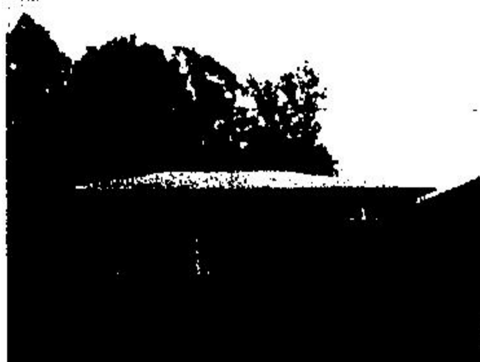
PARK AREA —Excellent location near schools, park and shopping. Lovely brick and stone bungalow, 3 bedrooms, family room with walkout, stone fireplace in living room. Immaculate condition, a roomy family home. Call Marion.

IN •GEORGETOWN• BRAMALEA •BRAMPTON •MALTON •MISSISSAUGA •ORANGEVILLE•REXDALE •WASAGA BEACH •COBOURG • COLLINGWOOD •WOODLAND BEACH