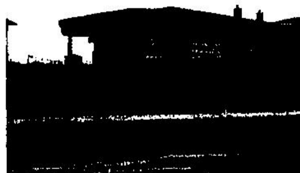
4 YEAR OLD BUNGALOW —with carport. Tastefully decorated with thick broadloom in living and dining rooms. You can also take advantage of the 9 1/4 percent mortgage, due in 1998. Listed at $59,000. Phone and ask for "Del".