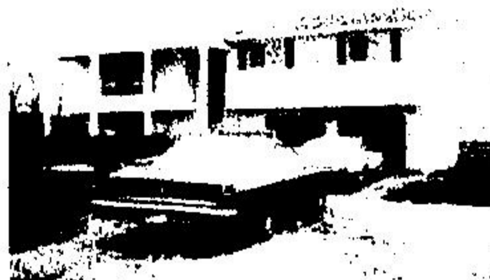
ONE ACRE —and a gorgeous home with loads of living space, including a family room with fireplace, walkout and ensuite bath. A games room, formal dining room and a super-sized master bedroom. Ideal for the active family. Call Rosemary.