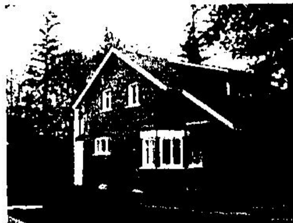
IN THE PARK —On a large private lot with mature trees is situated this charming home. Features 2 fireplaces, one in the master bedroom, 4 bedrooms in all, 2 sunrooms and lush broadloom throughout. Asking $64,500. Call Reg Cooper.