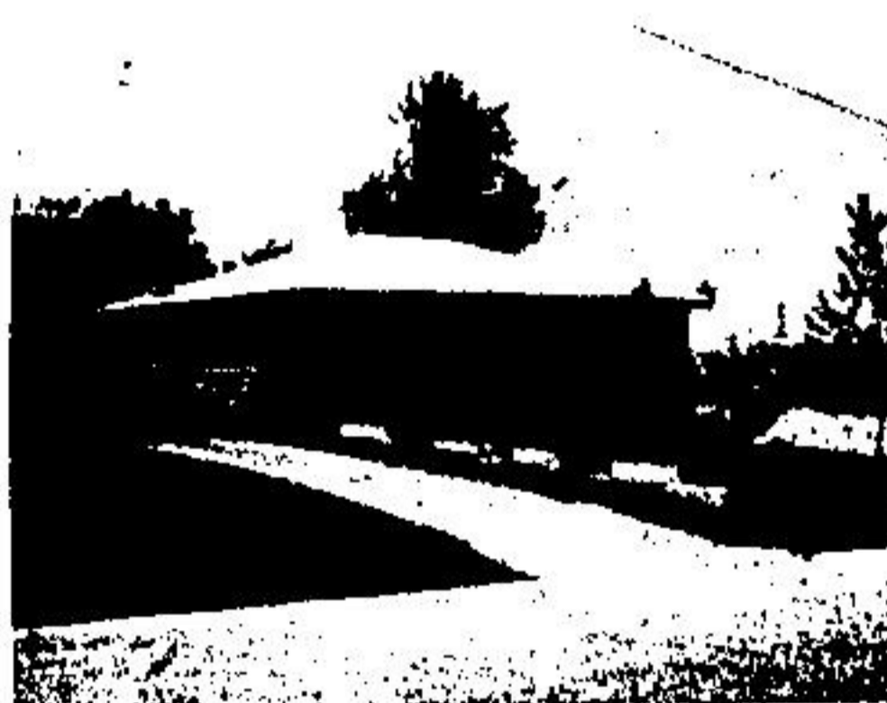
RAVINE LOT with the spring running water, right in Georgetown with a 3 bedroom brick bungalow, rec room, 2 bathrooms, close to GO Train. Priced to sell at $57,900. Call Herb.