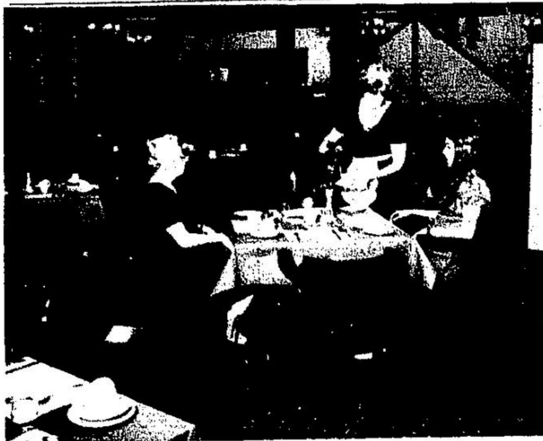
DINING AT THE COLONIAL HOTEL in Rockwood is catching on, according to numbers frequenting the new establishment. Already small office dinner parties are being requested as well as catering for a bridal luncheon. Besides the large upstairs dining hall another room is located downstairs in the Main St. building, capable of handling overflow guests.