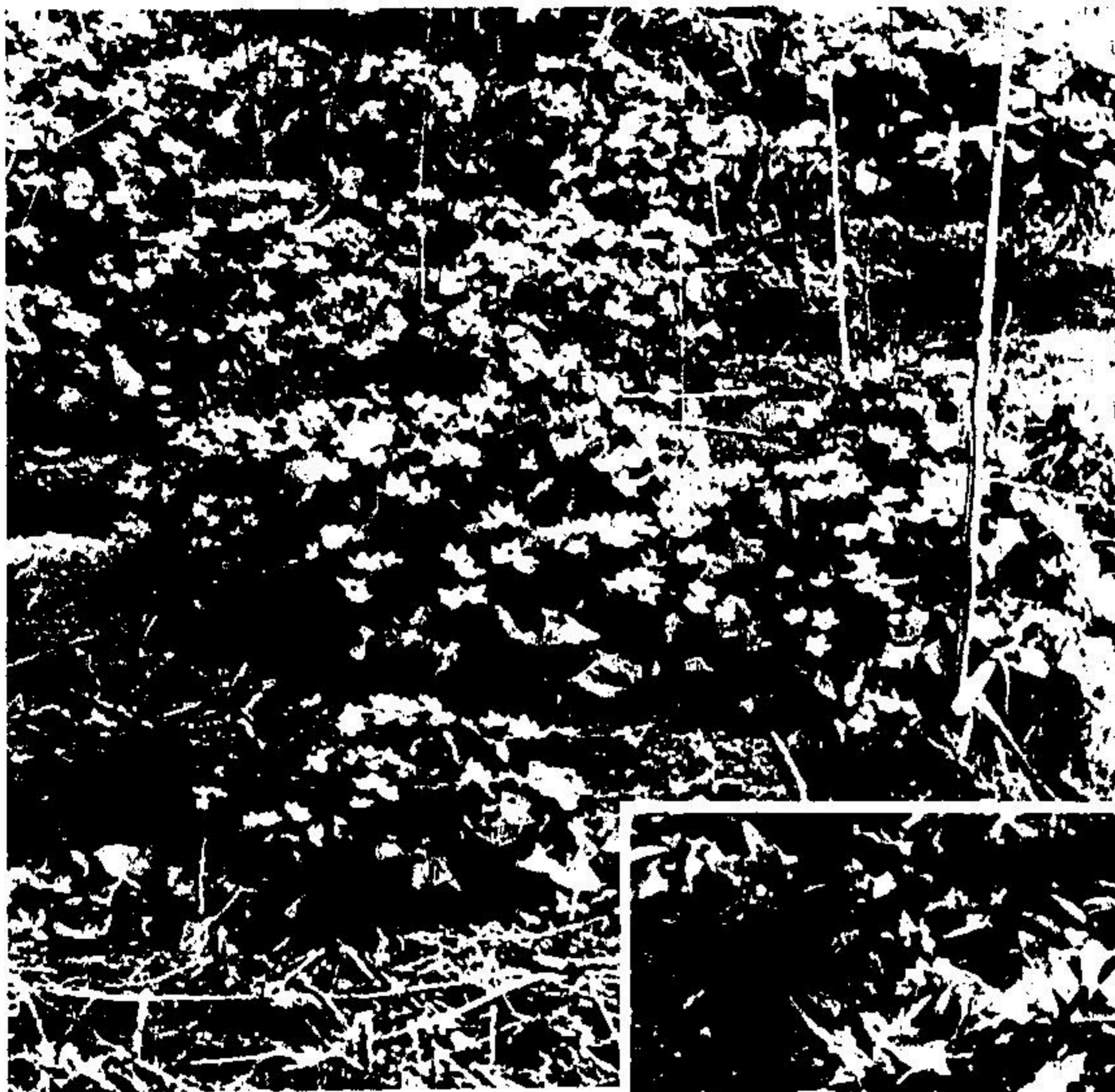
Marsh Marigolds in bloom.