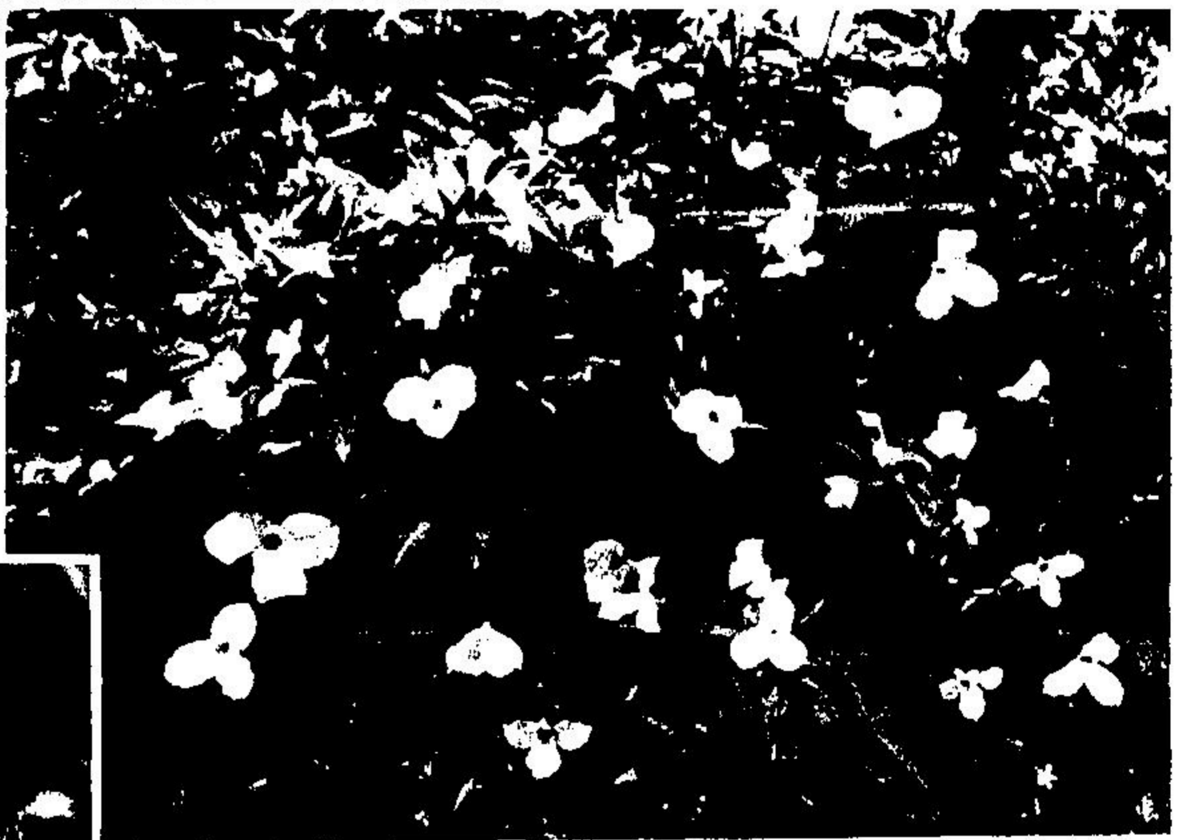
Trilliums in abundance.