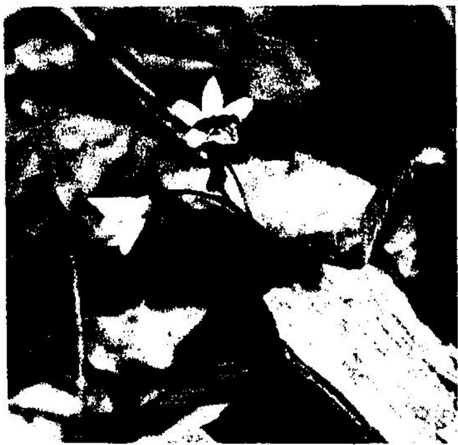
Bloodroot attracts a bee.