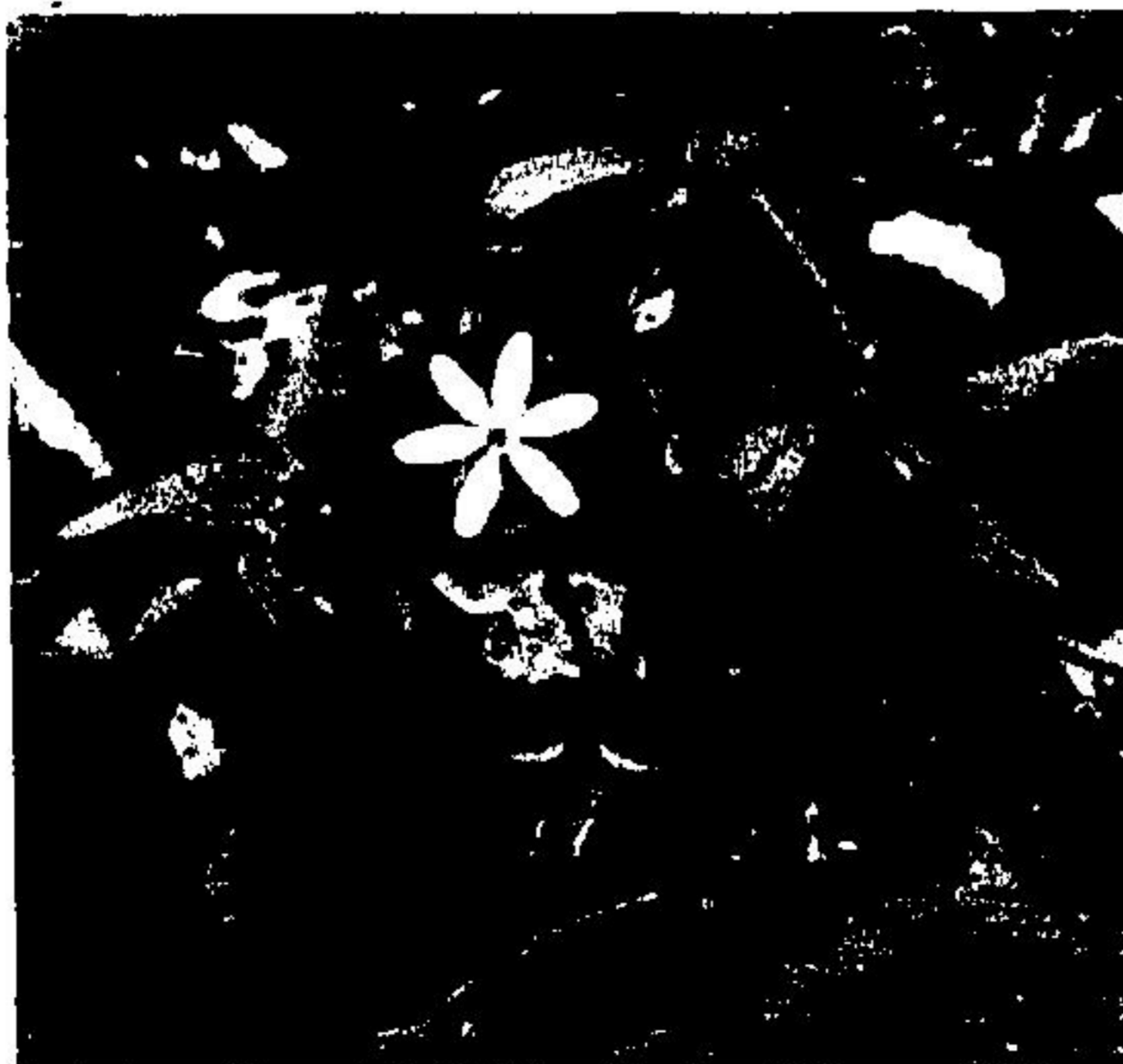
A Dogtooth Violet is visible in the foliage.