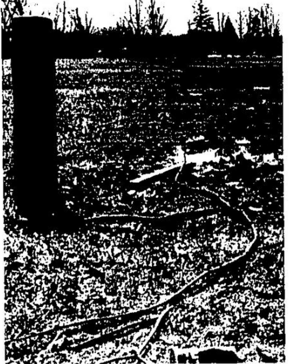
MELTED SNOW suddenly reveals mud and debris in some of our favorite places. The vistas at the park are marred with post-winter branches and garbage, due for seasonal clean-up soon.