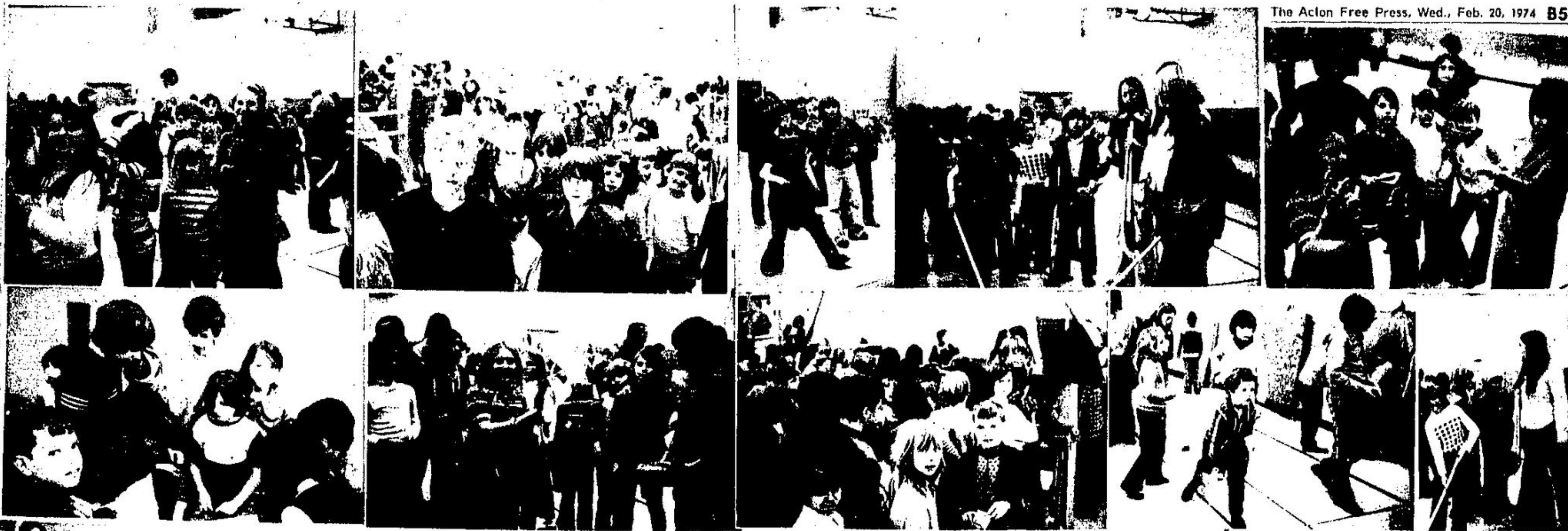
School days are fun days at Rockwood Centennial penny carnivals

ROCKWOOD CENTENNIAL public school bubbled with activity last Thursday during noon hour when pennies were grabbed up and exchanged in great flurries. Dozens of school children from grade one tykes to sophisticated grade eighthers flocked into the gymnasium to participate in the wonderful world of games and activities as sponsored by the school's student council. Throw the wet sponge, ring toss, bowling, draws, games with sticks, games with balls, all went by the board as the jar containers almost burst with