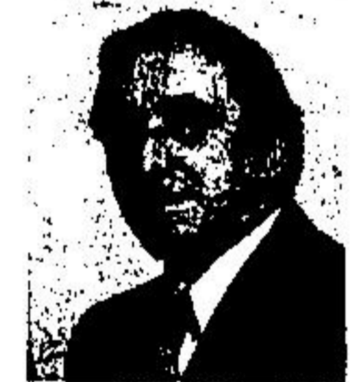
W. REX COCK

$54,500 Is a small price for this 3 bedroom country bungalow situated on a 1/2 acre lot 3 miles from town. Property like this hard to find. Call now for an appointment.