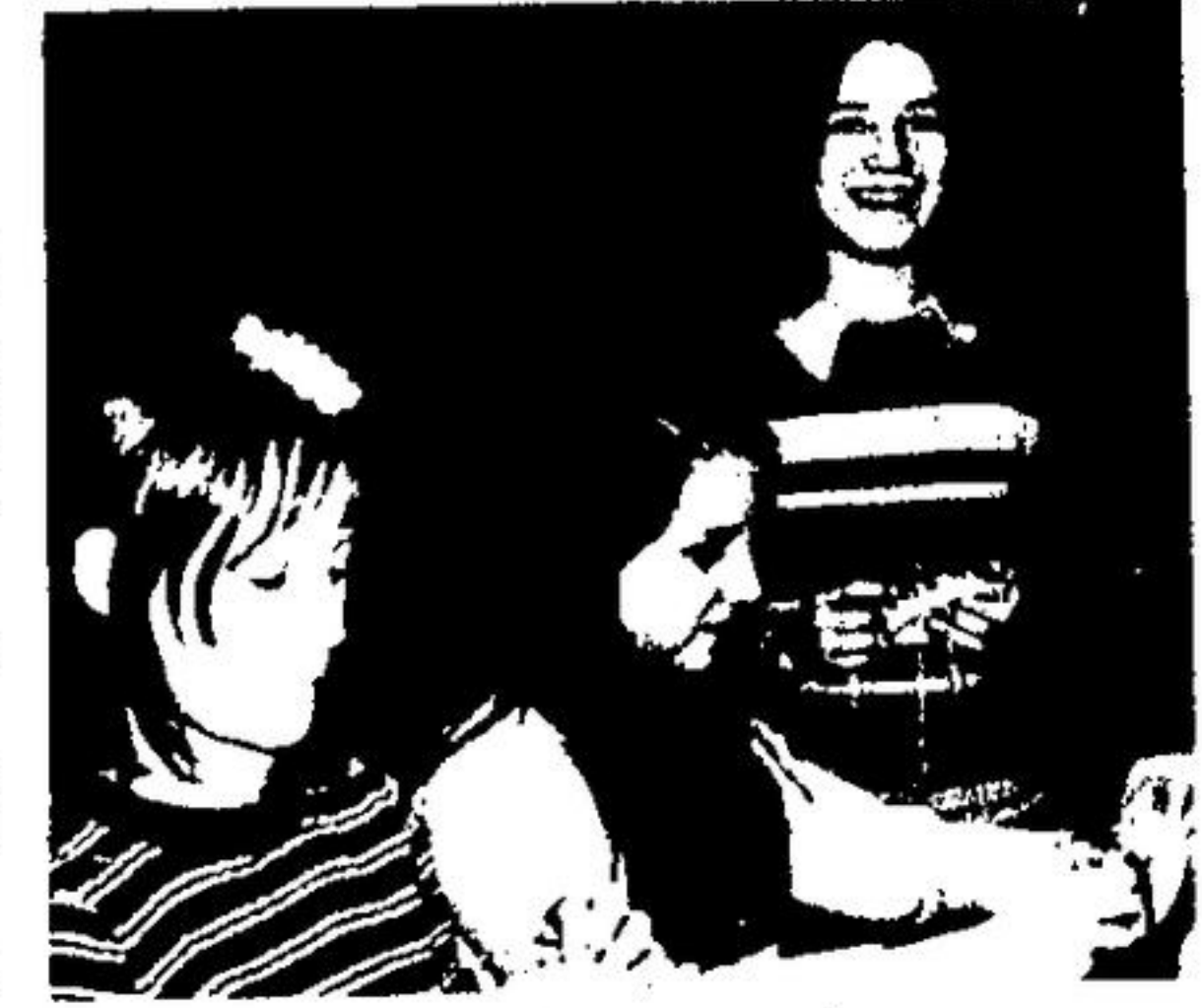
Making flowers on a loom

FLOWERS for All Occasions • Cut Flowers • Potted Plants • Funeral Arrangements • Corsages • Etc. Open 7 days a Week—8 a.m.—Til Dark—Phone 853-2980 "Always a good supply of FRESH CUT FLOWERS" WE WIRE FLOWERS ANYWHERE Caroline Flower & Garden Centre Acton's Leading Florist Two Miles West of Acton—South Side of Highway