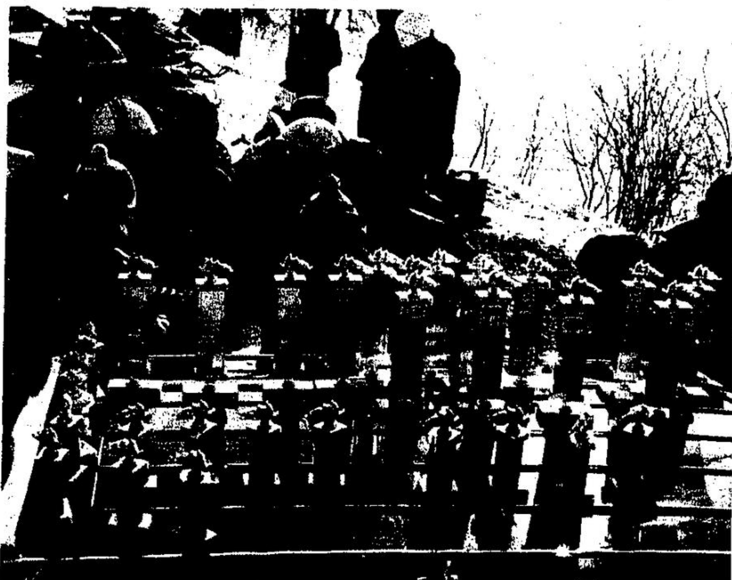
TROPHIES glittering in the sun waiting to be claimed by the winners of Sunday's Y's Men's club snowmobile races on Fairy Lake.