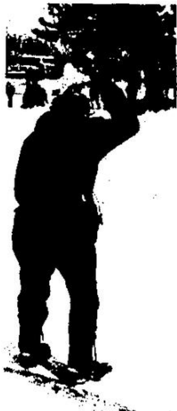
FLAGMAN starts the race at the lake Sunday afternoon.