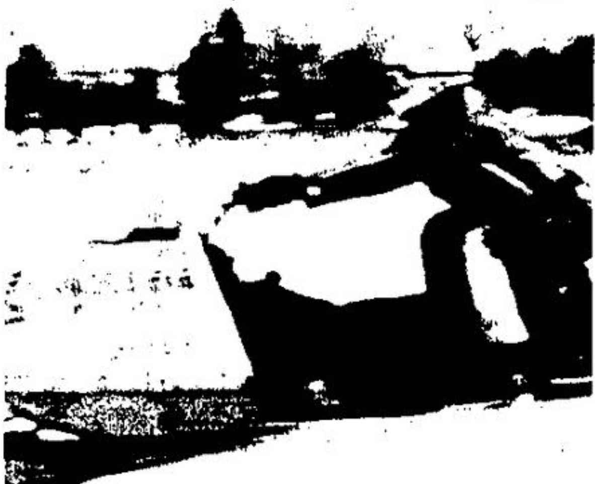
SPEEDSTER Dan Arbic is too fast for the camera.