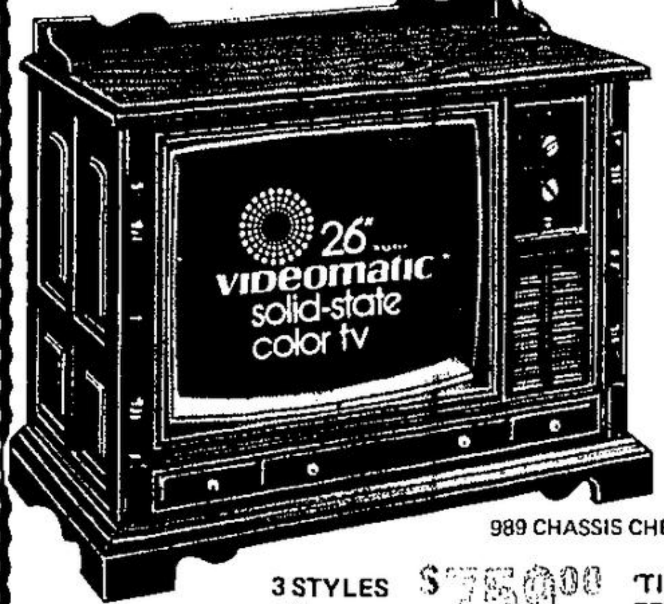
3 STYLES $759.00 AT TILL FEB. 16TH

35 MAIN ST. S. - SAME PLACE, NEW STREET NUMBER Georgetown - 877-9796