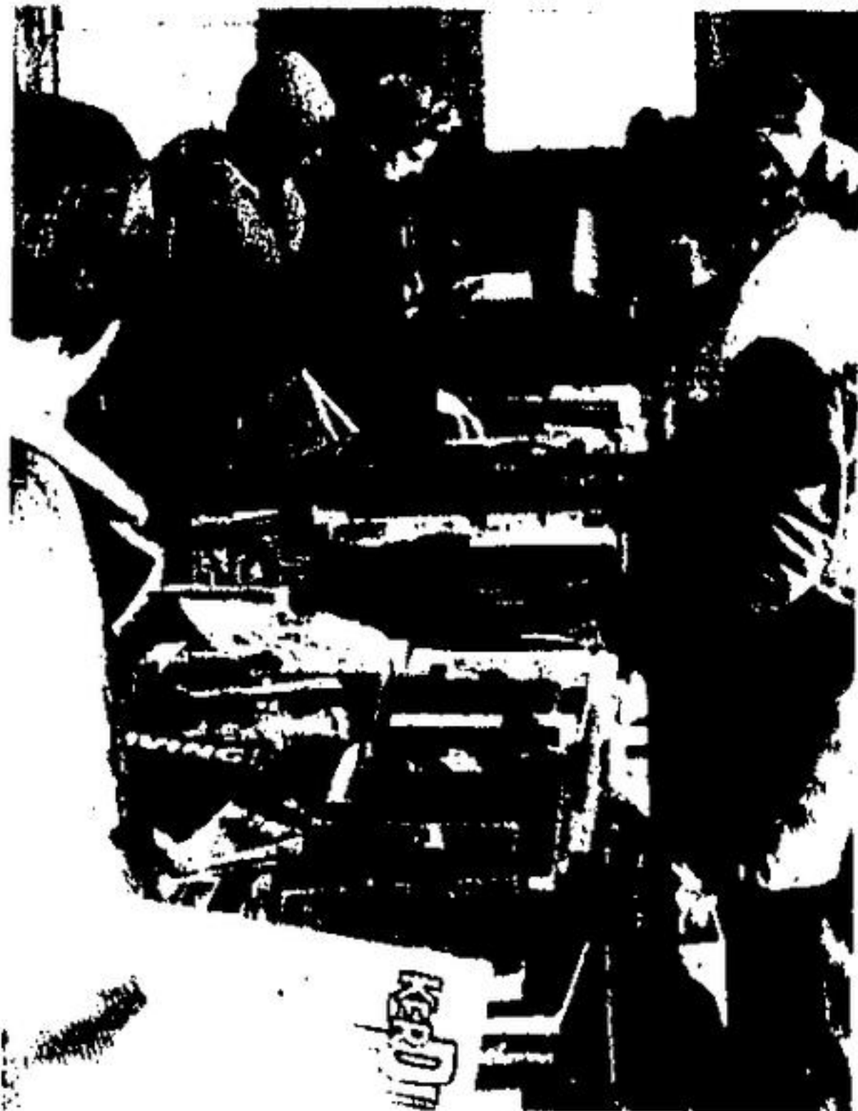
BOOK SALE at the Y Saturday was sponsored by the Y's Menettes club. Toys, games and white elephants also intrigued the browsers.