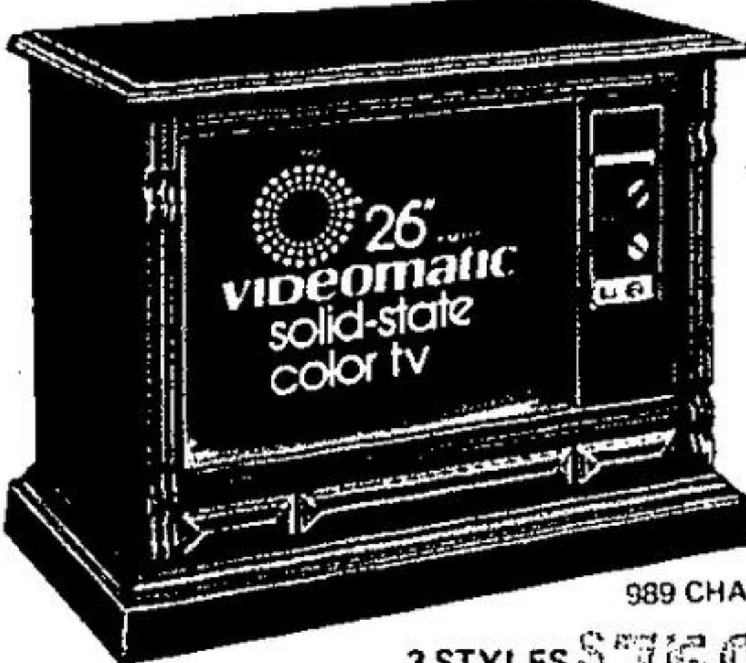
3 STYLES $759.00 AT TILL FEB. 16TH