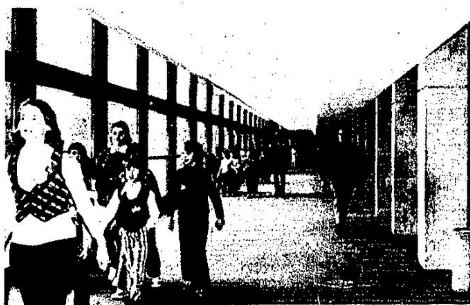
GETTING THERE is half the fun. On a trip to the Science Centre grade four classes from Robert Little get a view of Don Valley on the way to the exhibits.

During a film presentation and lecture on air pollution the students learned that pollution can kill. They were told that nobody owns the air so it's a great place to put garbage. Even if we burn our garbage it goes into the air. The instructor stressed the importance of doing away with excess packaging and said the best container in the world is an ice cream cone - because we eat it.