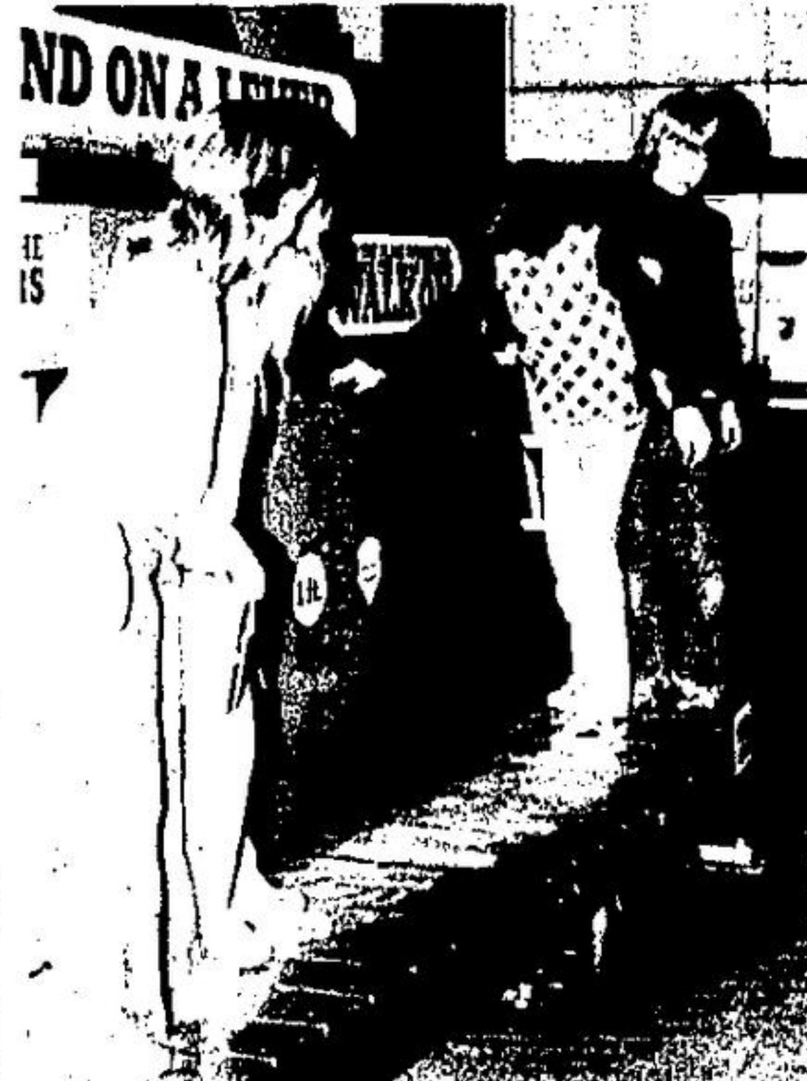
STANDING ON a giant lever these pupils balance themselves against 150 lb. weight, in the science arcade where participation is part of the fun.