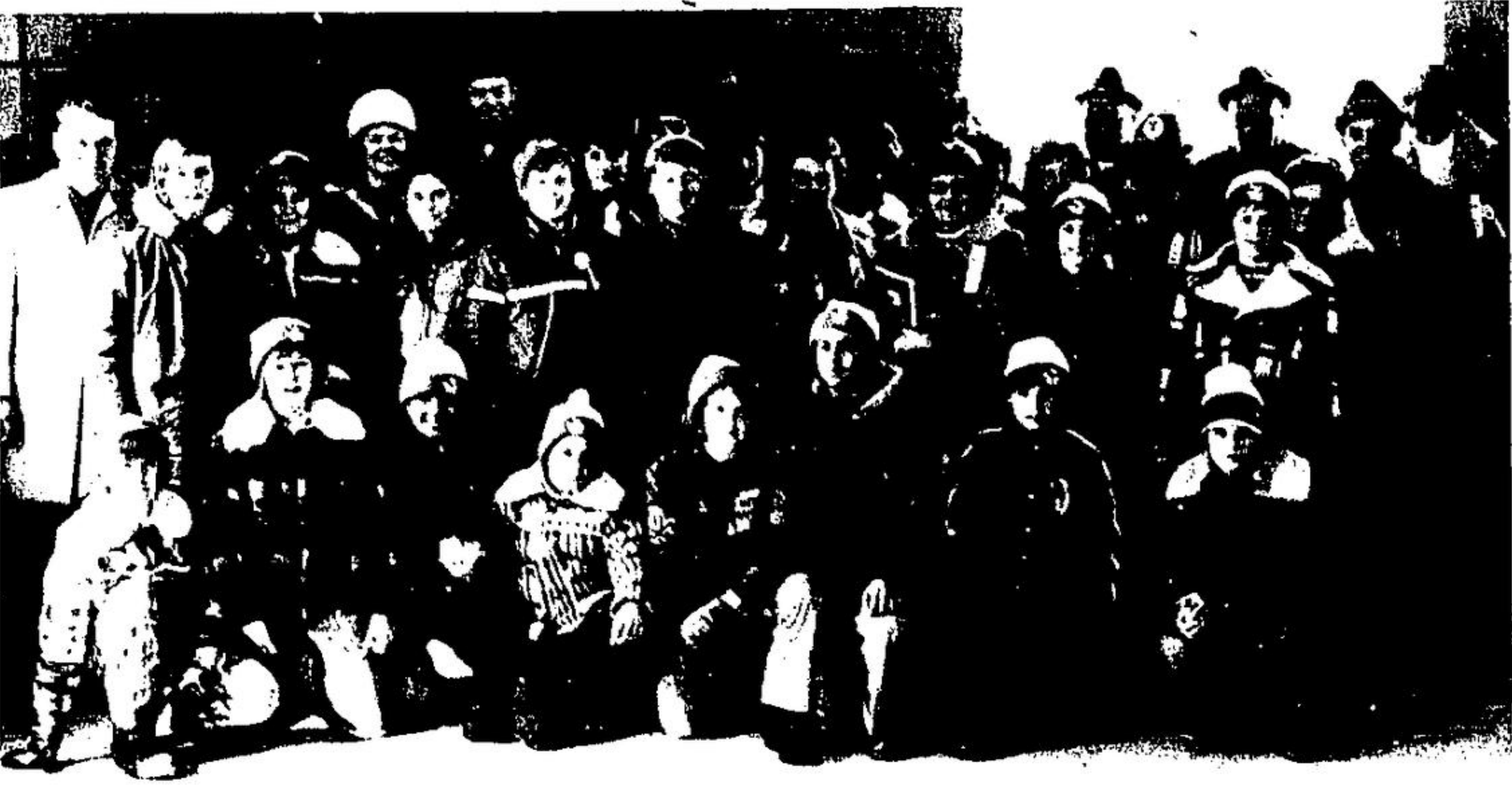
ACTON Y'S MEN'S peewee pucksters and their faithful supporters posed for the Free Press camera when they arrived back at the community centre Monday morning following their successful trip to Sault Ste. Marie, where they won two games in the Bon Soo tournament, before losing their first