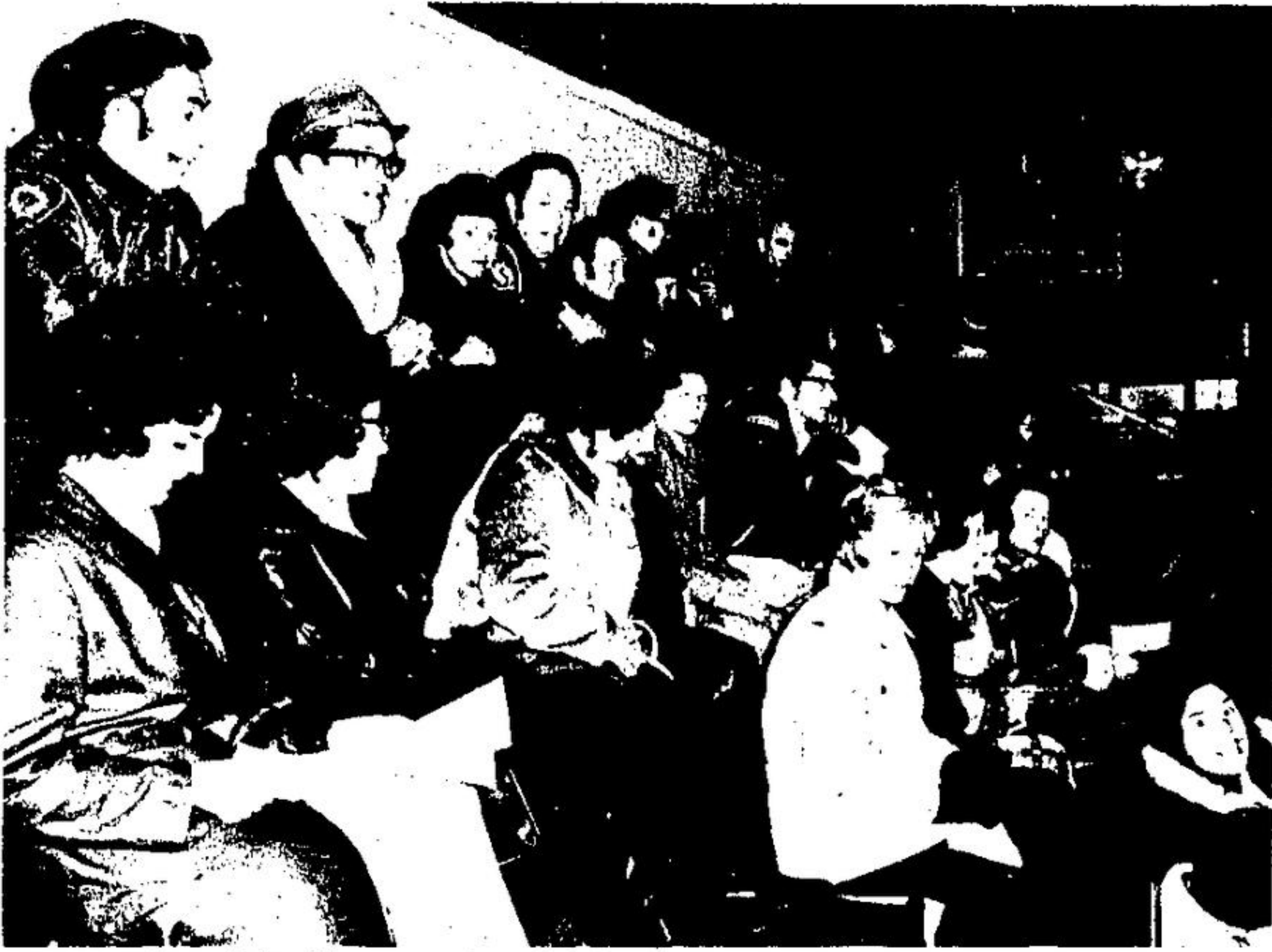
ACTON MINOR HOCKEY parents showed their support for the local novice, atom, peewee, bantam and midget teams by almost filling one section of the Ridgetown Arena for the second half of the annual challenge series in Ridgetown on the weekend. After nine games the two towns were tied at four wins and a tie each, but Ridgetown won on total goals by two.

4 The Acton Free Press, Wed., Jan. 23, 1974