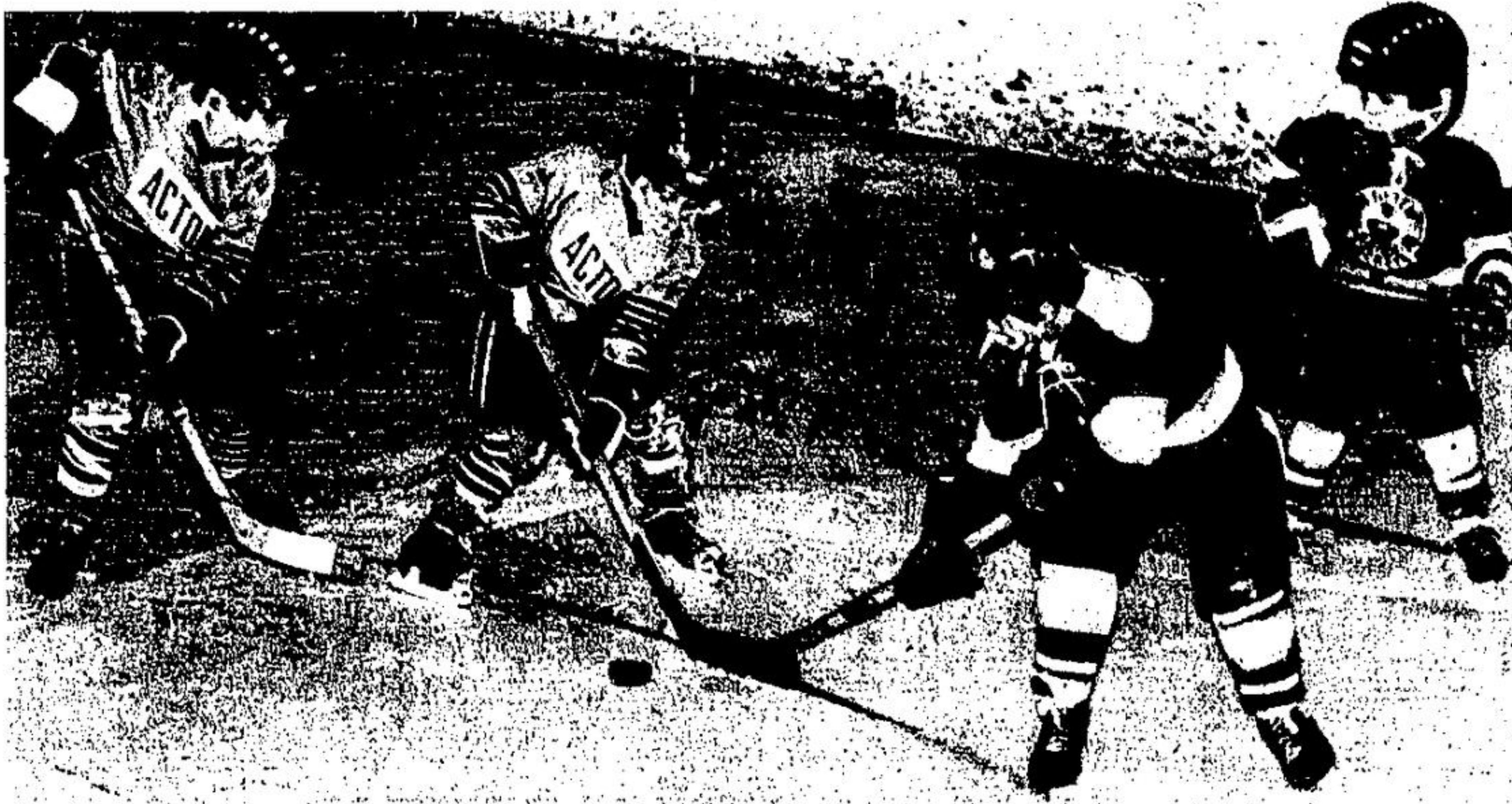
ACTON NOVICES, probably the most promising young hockey team in town pulled a big upset when they walked into Milton and knocked off the Milton PLR Sockets 3-2 Sunday afternoon. Acton minor