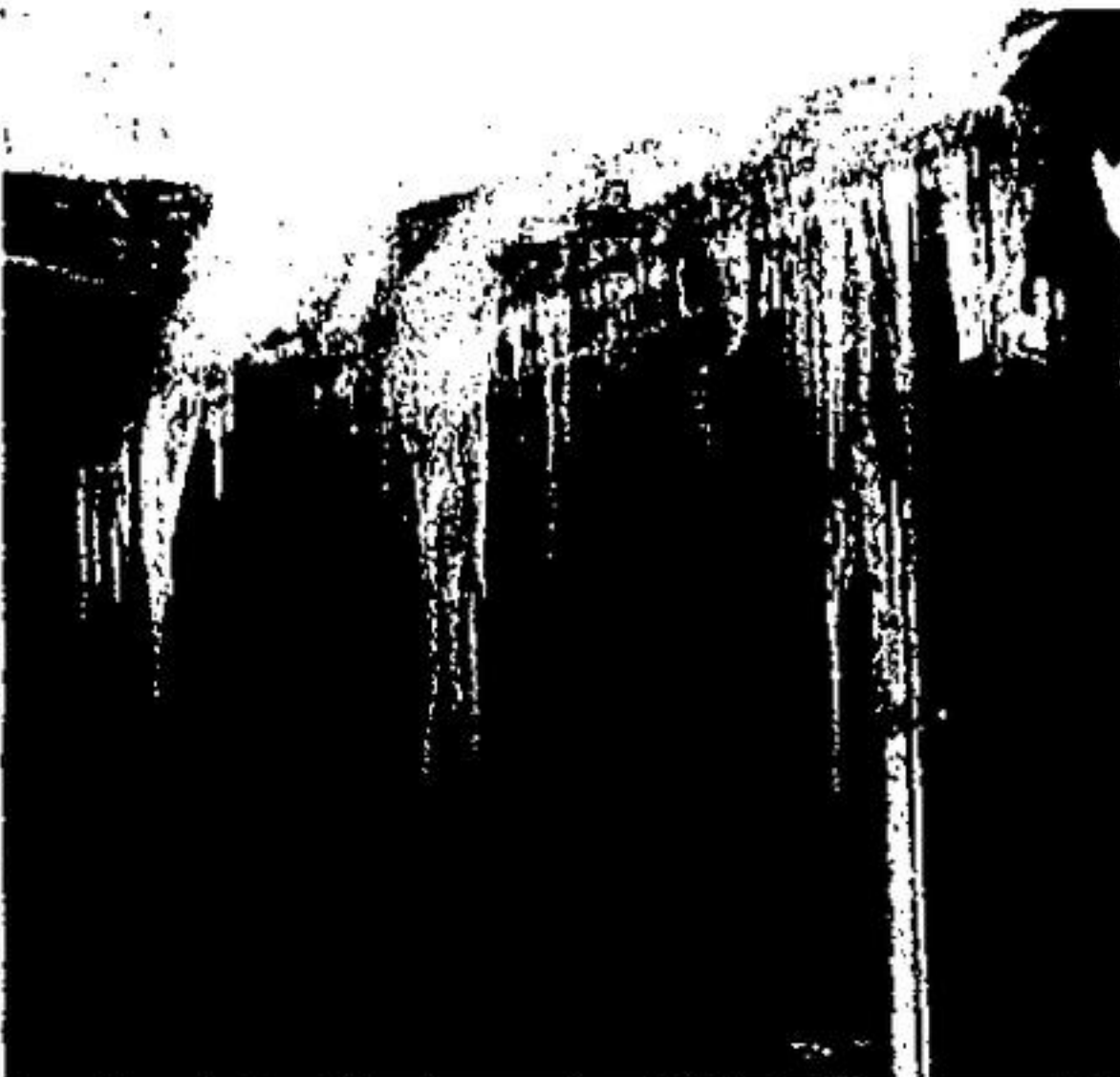
HOUSES ARE fringed with spangly icicles these days. Jack Carpenter's camera records this interplay of light and shadow.

The authority will clean up the area and take out the stumps which have not yet rotted away. The banks will also be graded along the Hume property.