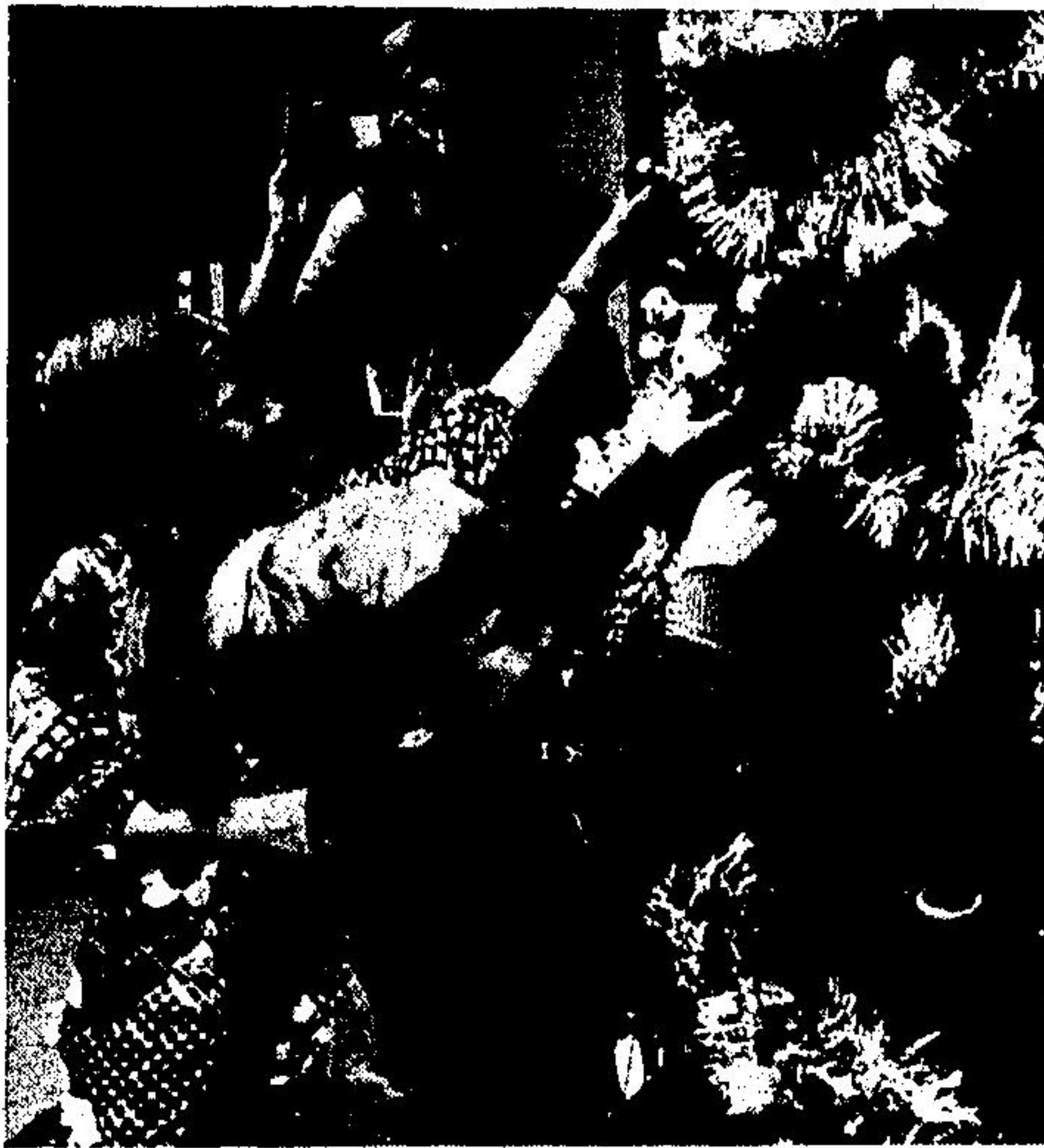
AMONG THE MOST cherished pictures any family can make are those of their bright-eyed youngsters registering their joy as they approach the tree on Christmas morning. Don't forget to have your camera ready for shots like this on Dec. 25.

Kissing Under Mistletoe The word "mistletoe" derives from the Anglo-Saxon word "mistle-tan." It is a parasitic plant which grows on evergreen trees, with small yellowish-green leaves, yellowish flowers and waxy white, poisonous berries. Under a sprig of mistletoe men are by custom privileged to kiss any women standing under it. The man is supposed to first remove one of the berries and present it to the woman. When all the berries are gone, this kissing game is over. It is thought this custom comes from an early pagan marriage rite. Mistletoe was considered sacred by the Druids in ancient Britain and they performed elaborate ceremonies around it at the winter solstice. Because of these pagan associations, it is seldom used in church decorations.