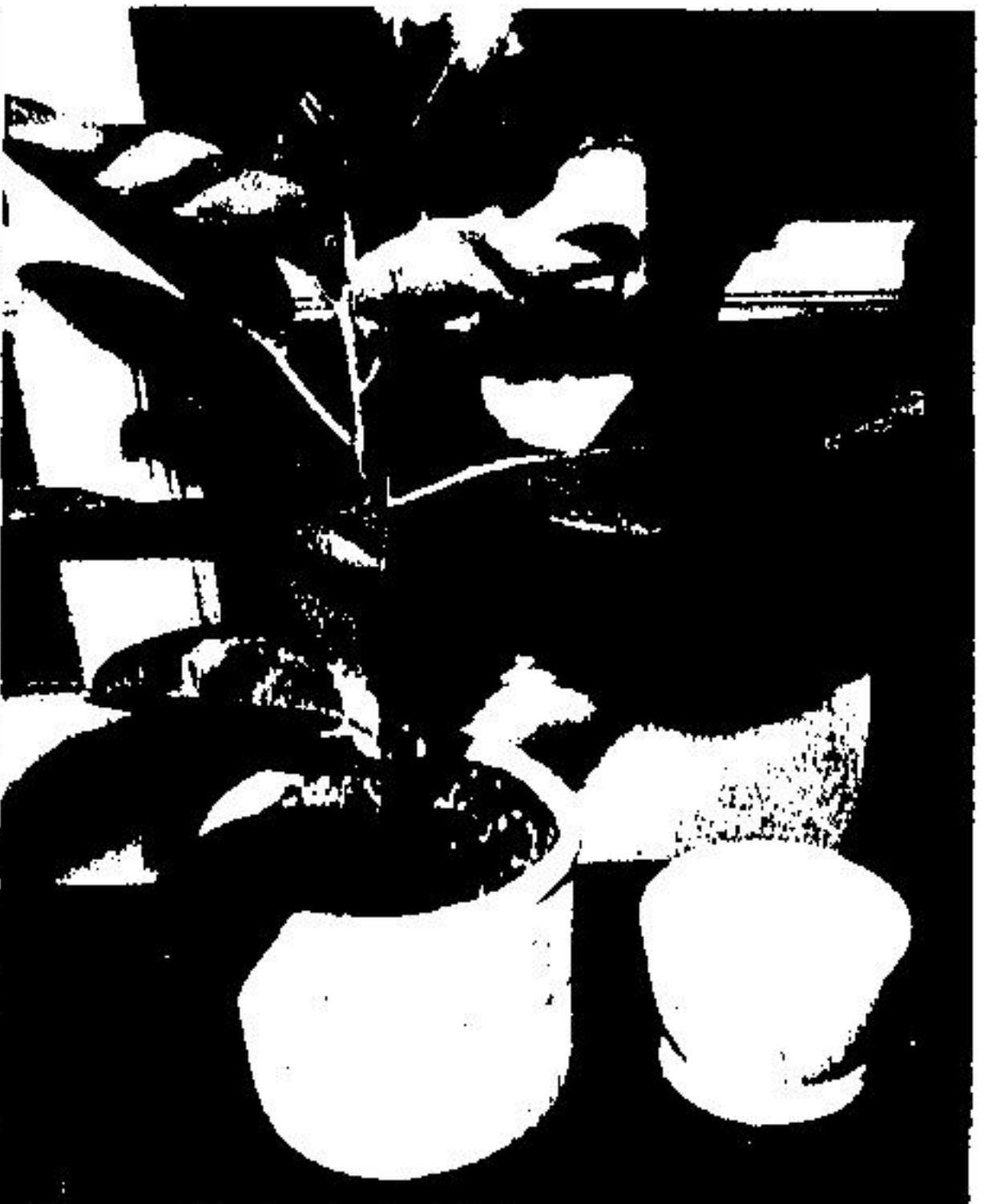
The newer varieties of poinsettias are no longer temperamental and have become permanent houseplants. Like many others they benefit from good light exposure and regular feeding with a soluble fertilizer. They provide a wonderful blaze of color in the winter months. Rubber plants and other "tropical" evergreens benefit from an occasional wash with room temperature water.