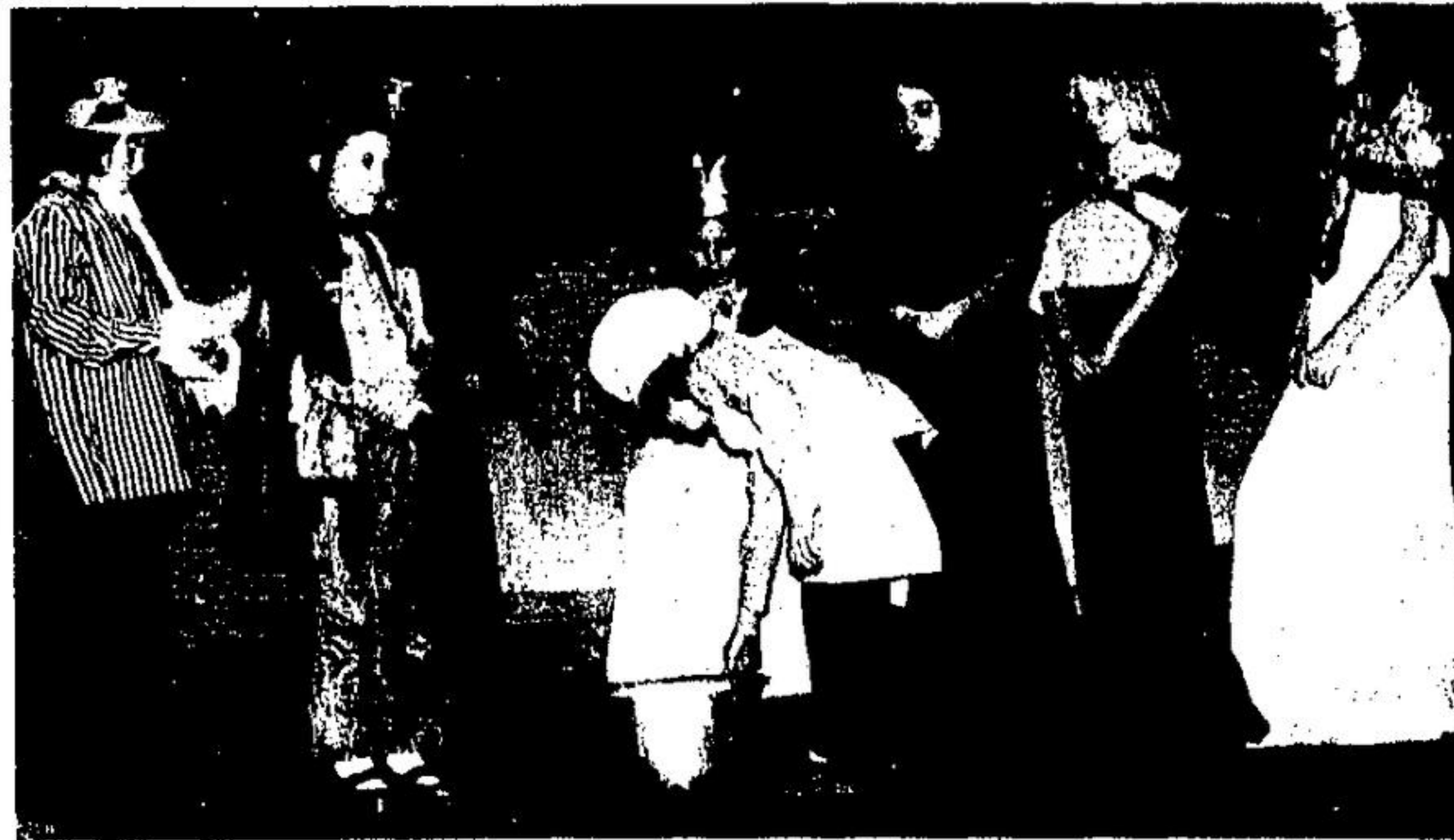
INVENTION OF plum pudding finds the cook stirring the pot at the Explorers part of the program. School and young groups took part.