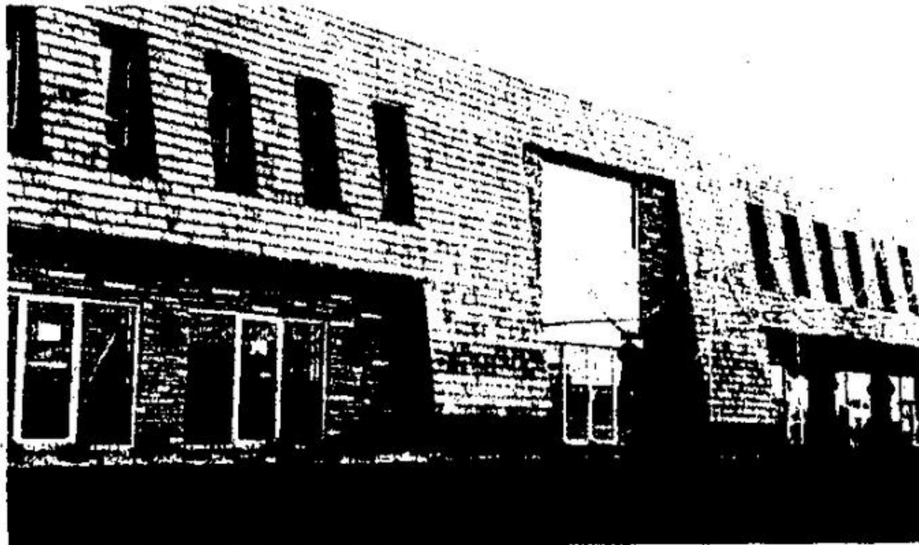
THE NEW HOME of Halton CAS is shown here. Located in an Industrial Mall in Burlington, the CAS rents 6,200 square feet on the second floor.

probation. Another is working with a large family which is in touch with the agency but has declined the help of every community agency. The auxiliary volunteer is a community's link with this family.