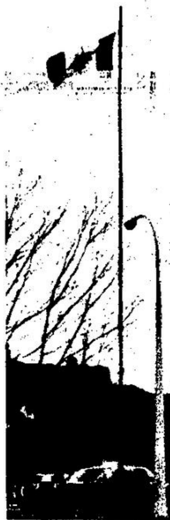
INTERNATIONAL signal of distress — an upside down flag — flew over the post office for two days. Help came, in the form of a new rope.

It was of interest that Georgetown Council has approved a tender for sanitary landfill site preparation and will be receiving garbage from Nassagaweya and Milton. This will be trucked to the Georgetown dump. GUARD feels there will be reaction from Georgetown residents and if so GUARD is prepared to call a general meeting and air the facts about the McLaren release.