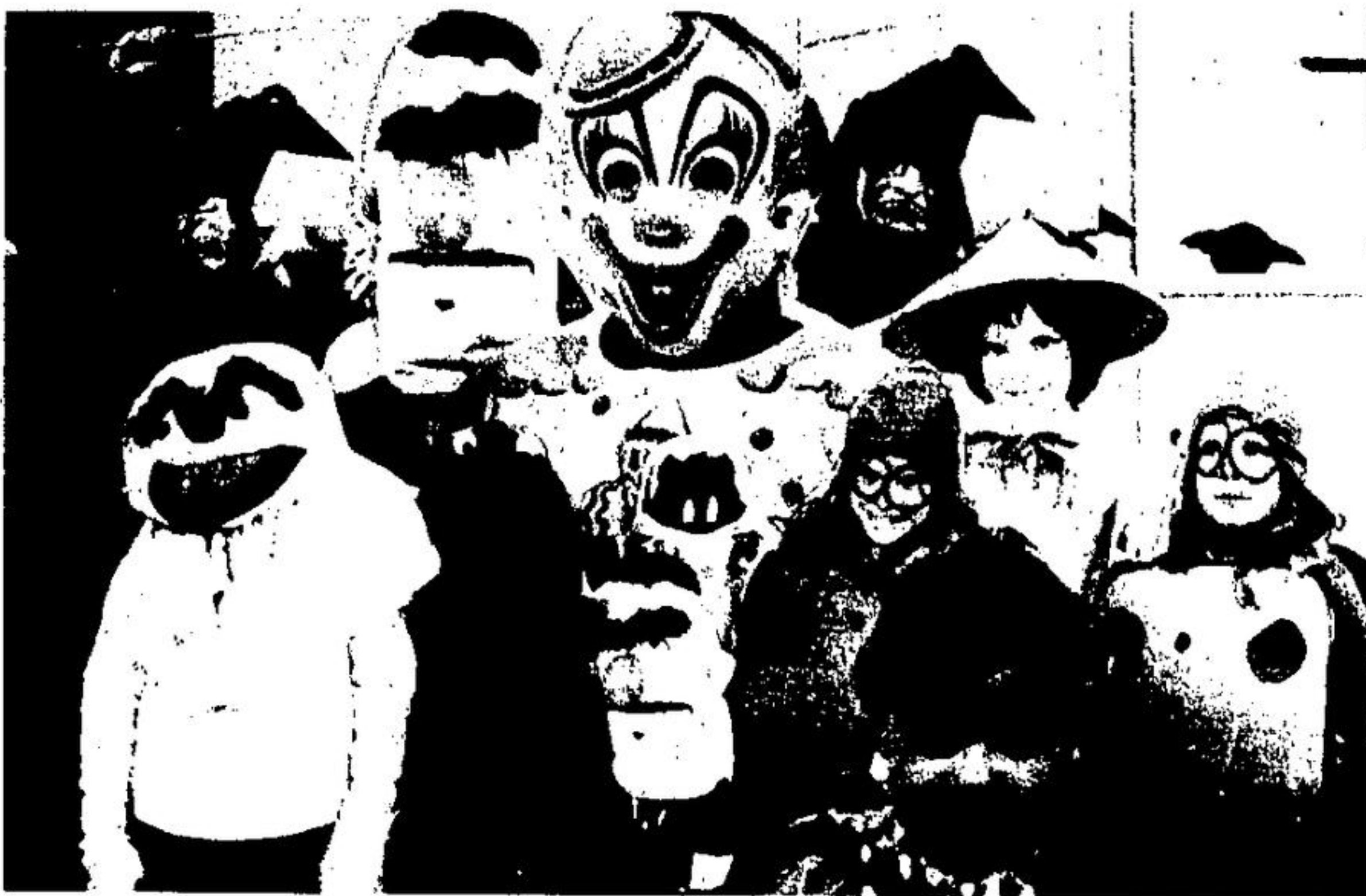
SESAME STREET was the favorite as some 23 games and prizes for the best costumes required children gathered at the St. John's parish hall in Rockwood to enjoy the annual Hallowe'en party with the Junior Auxiliary last Monday night. Party

Disasters are more often caused by lack of action than by questionable decisions!