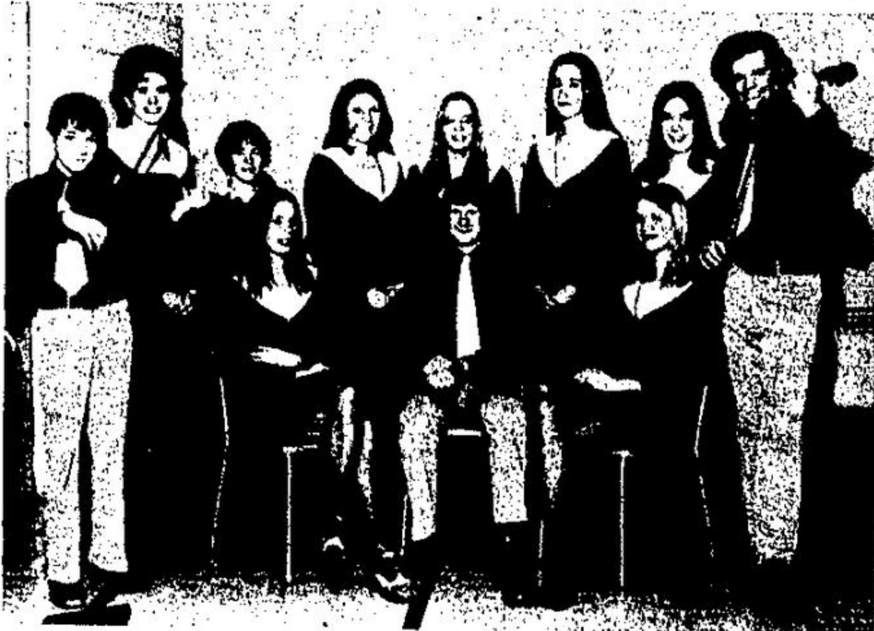
MEMBERS OF THE ERAMOSA Choral Society prepare to participate in one of their musical engagements. Last Sunday's event was the 125th anniversary of the Burns Presbyterian Church in Erin at which guests present had the opportunity of hearing the orchestra achievements of some of the Choral Society members.

Nassagaweya. This will proceed down the first line of Nassagaweya to the property immediately below the Rod and Gun Club.