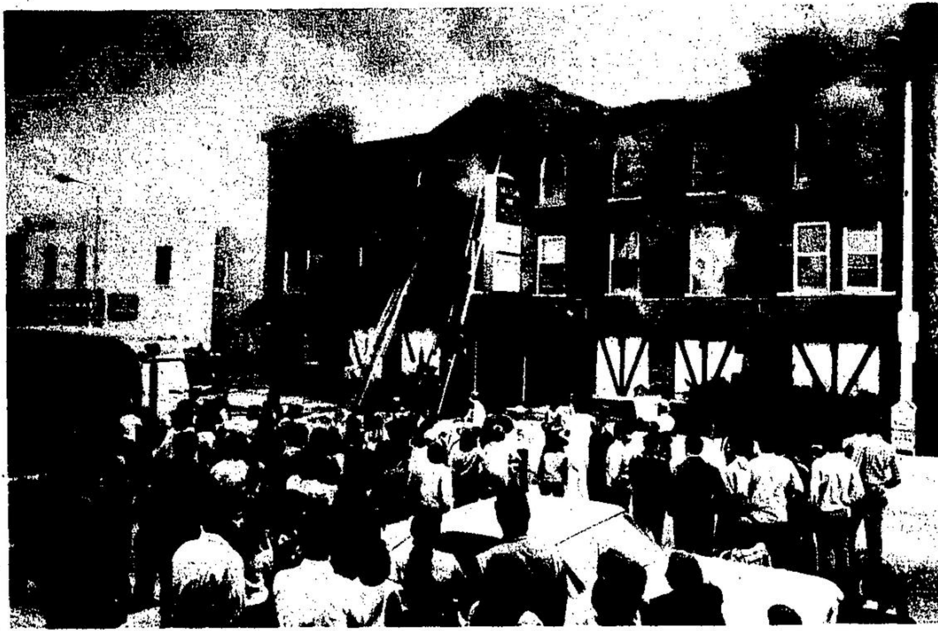
CROWDS GATHERED quickly when the Milton Inn fire broke out at around 5.30 p.m. Many never left and hundreds left and came back later. Even in the wee hours of the morning, crowds of people lined the streets and sidewalks along Main and Brown Sts.