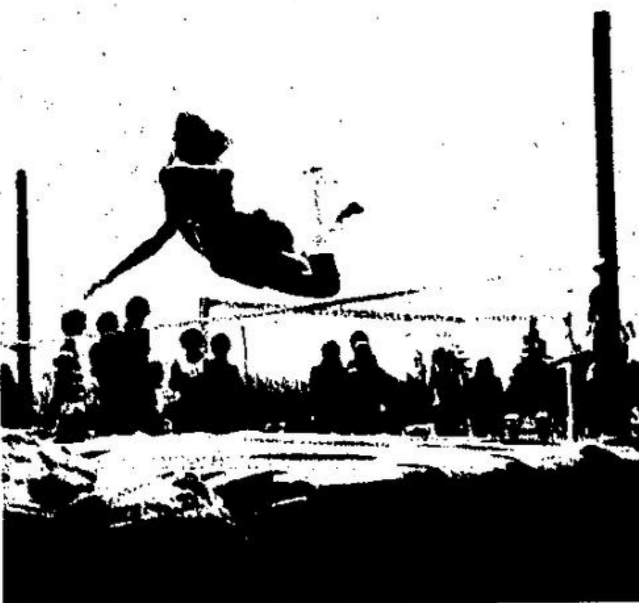
DISPLAYING an awkward high jump style at the track and field meet at the Ukrainian camp over the weekend this female athlete cleared the bar easily. Superb facilities at Weselka allowed large numbers of young Ukrainian athletes from Canada and the United States to compete in the games.