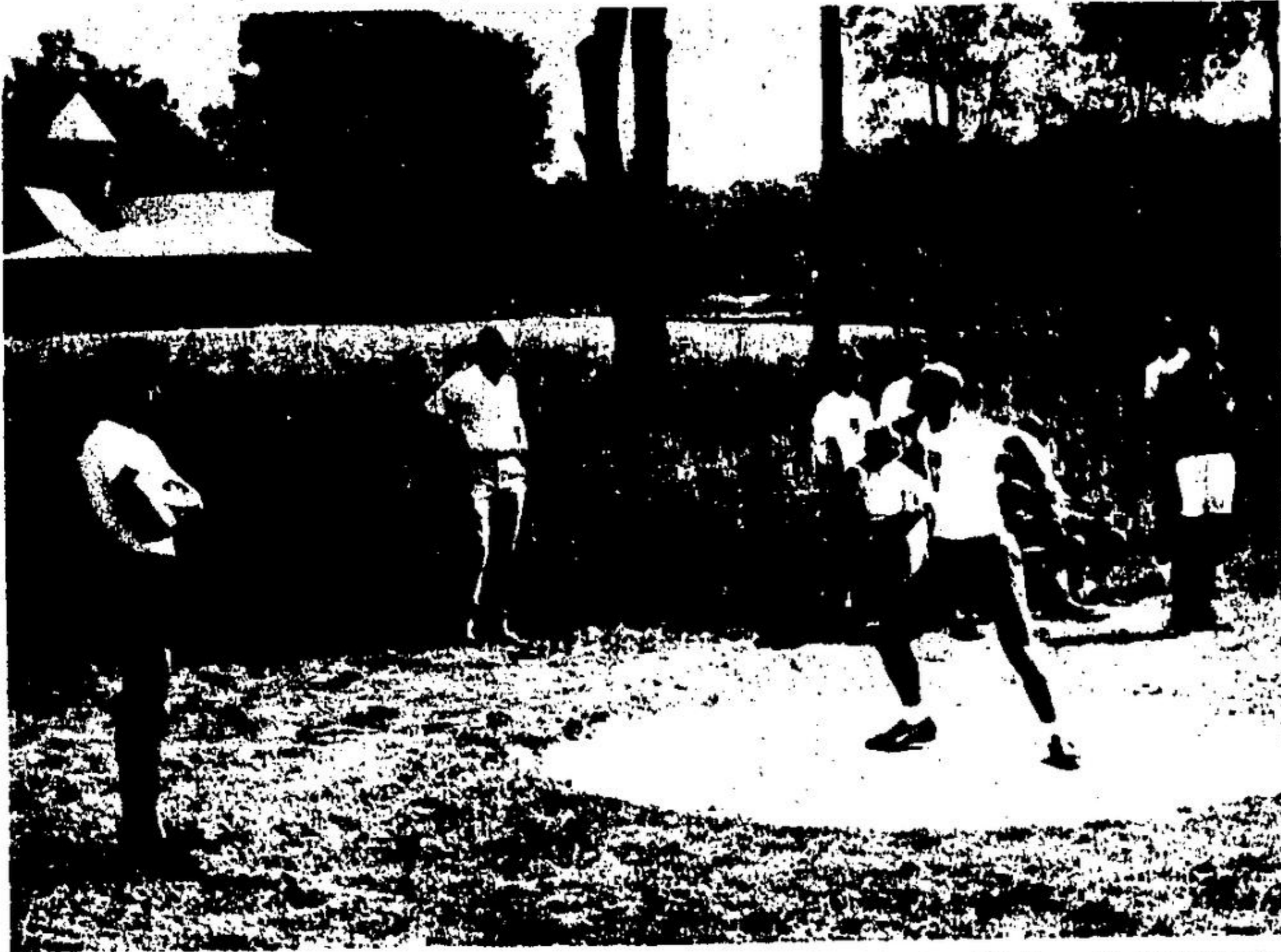
PREPARING to hurl the discus, a youth does manoeuvres at the Ukrainian Camp near Acton. Athletes of Ukrainian origin from Canada and the United States