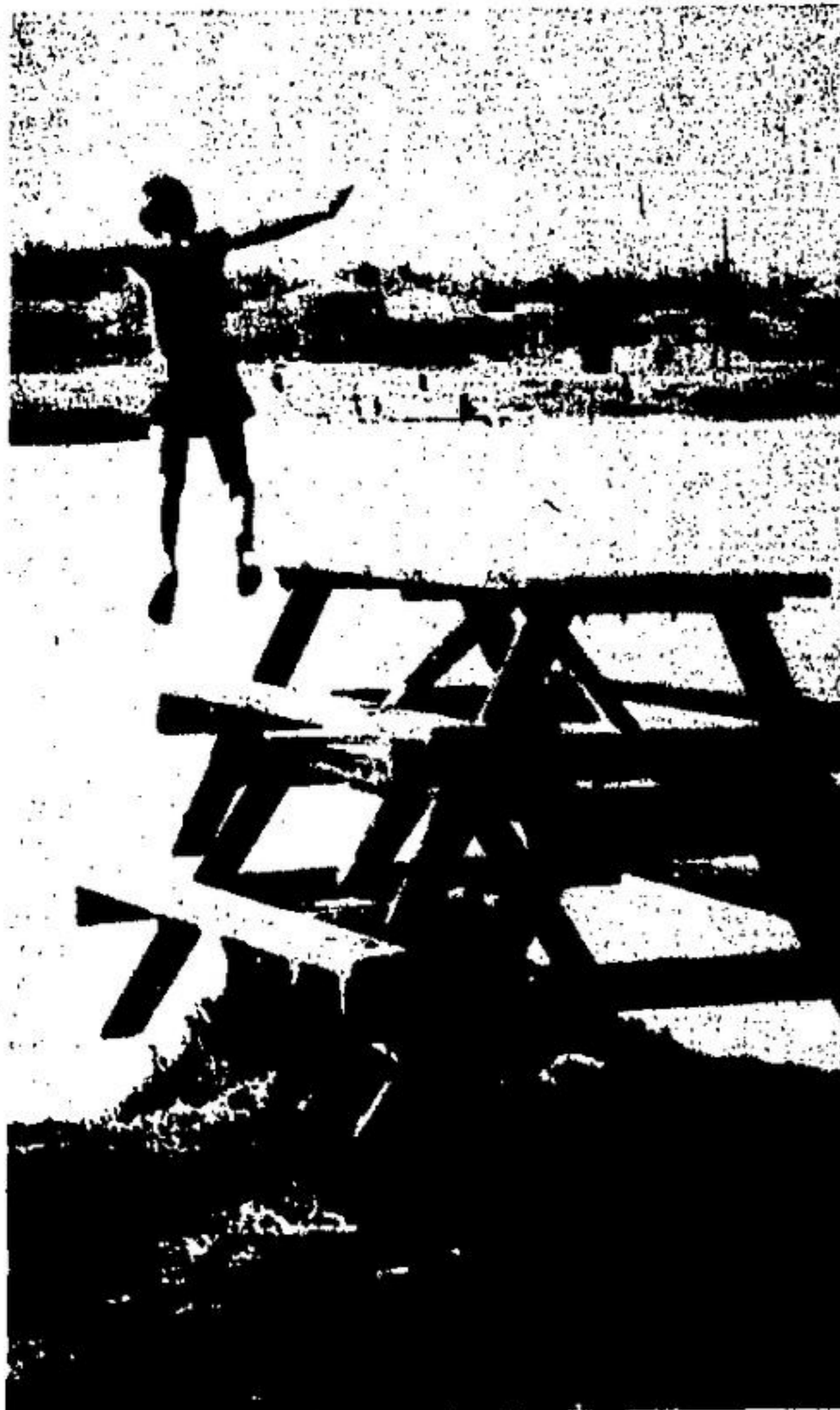
One way to cool off!

Though not yet initiated, a clean up program will remove dirt that has spread across the new asphalt as soon as the paving program is complete.