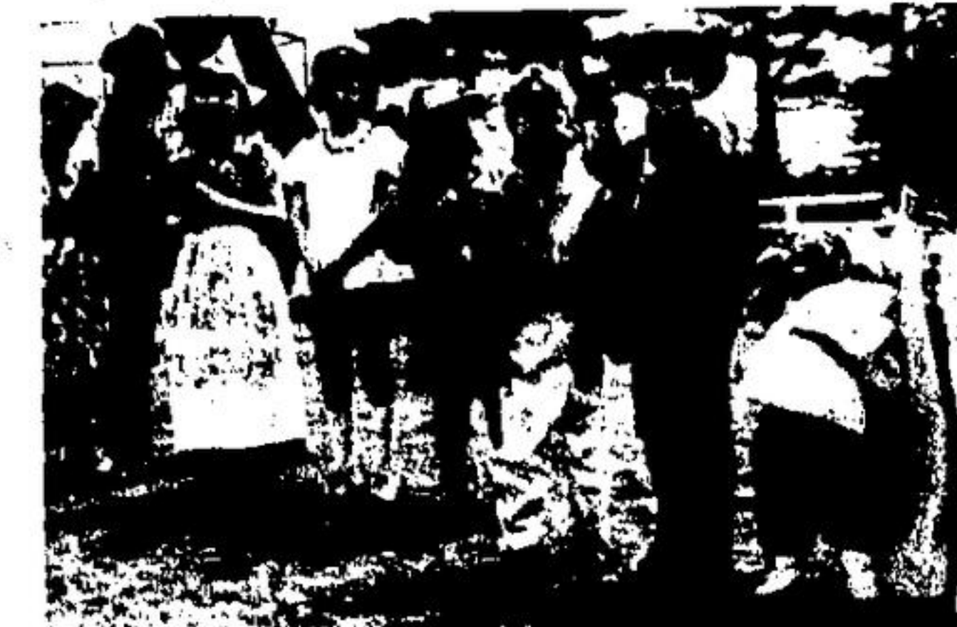
COSTUMES GALORE and the judges had a difficult decision to make with children from many areas of Eramosa lining up for entry in the Rockmosa carnival.