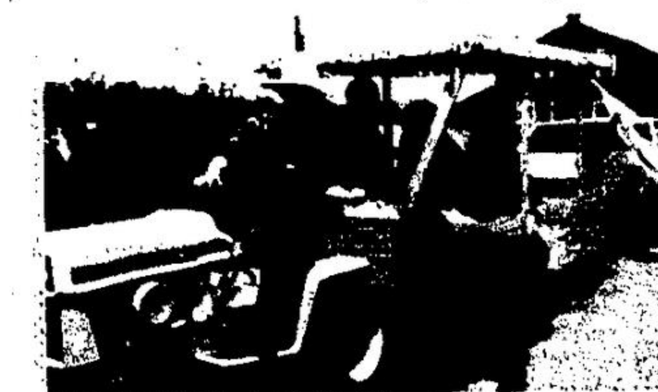
TOP ENTRY for the family floats was the Burton Hill family dressed in authentic early Rockwood Quaker costumes. They are pictured waiting for the parade to start up.