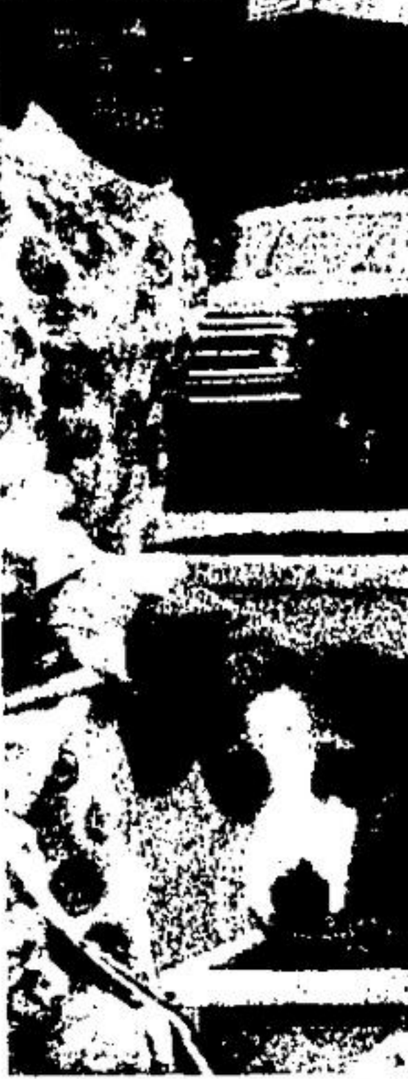
200 kids and a dog in parade