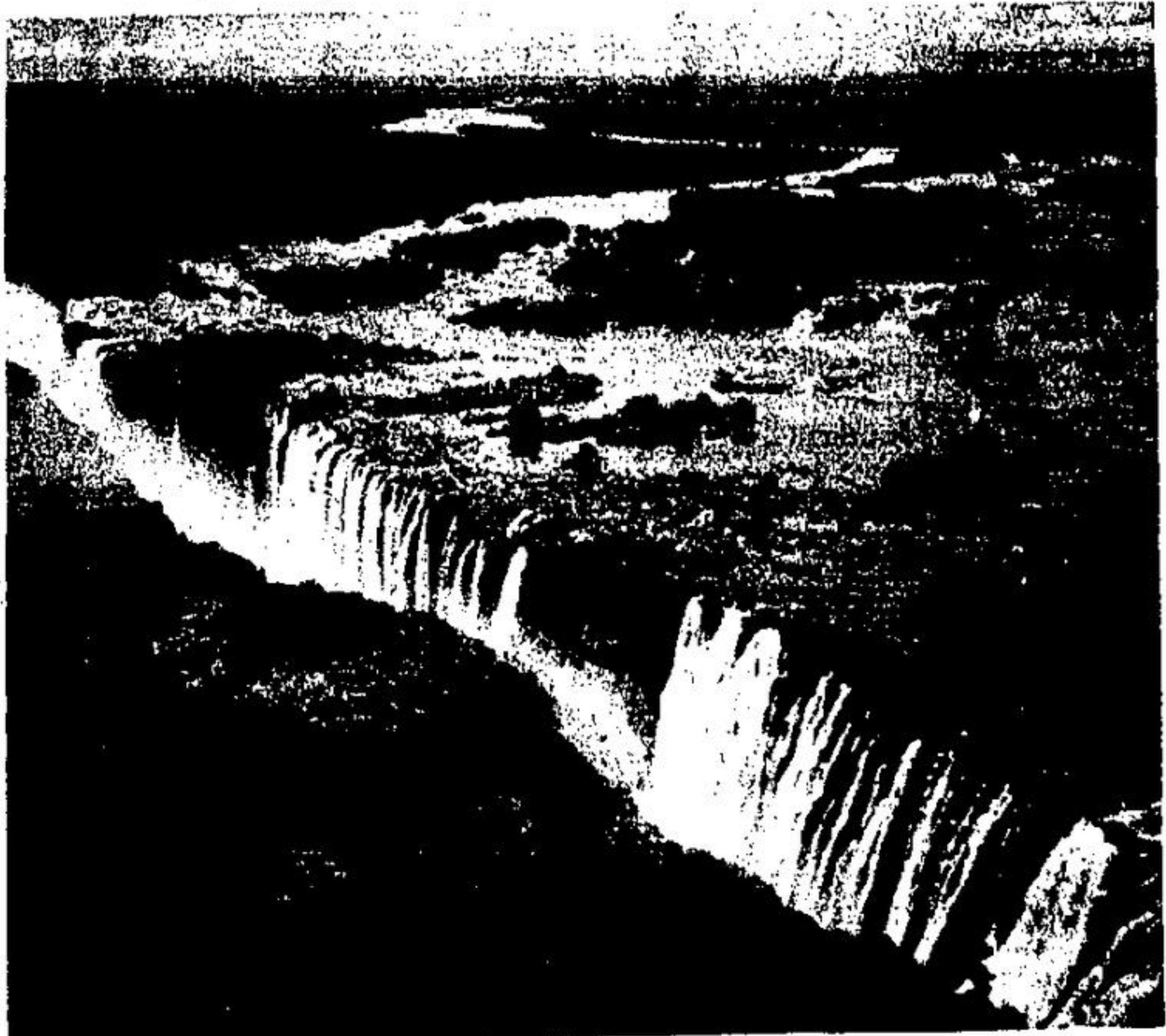
AERIAL VIEW of Victoria falls shows district girls were sightseeing before the rugged terrain in which the two they were slain by Zambian troops.