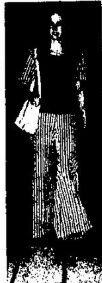
JANICE DRINKWALTER models a striped slack outfit with short-sleeved sweater that any teen will love Available in the Salon Rendezvous for only $23.99