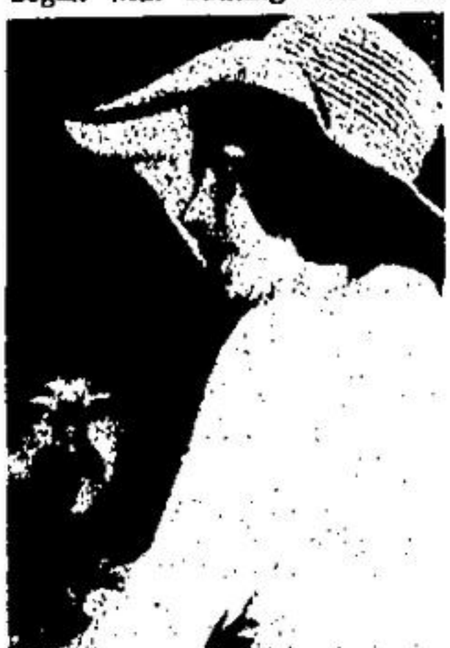
JEWELLERY display at intermission - model Judy Beerman and commentator Shirley Skeggs.