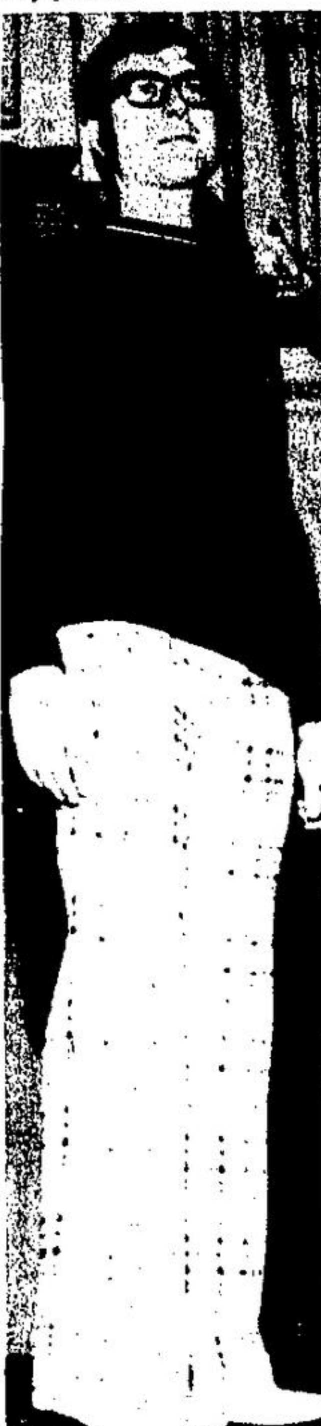
MEN'S WEAR added variety to Zellers fashions Wednesday. Brian Skeggs volunteered to model.