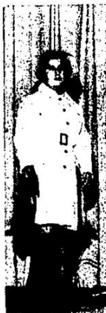
MRS. MAY ALLAN fashioned the all-weather look complete with large Bonnet, all-weather coat, high knee boots, purse and gloves. Coat retails for only $18.95

A few of the spring styles available at Zeller's in Georgetown were previewed to a large Acton audience last week.