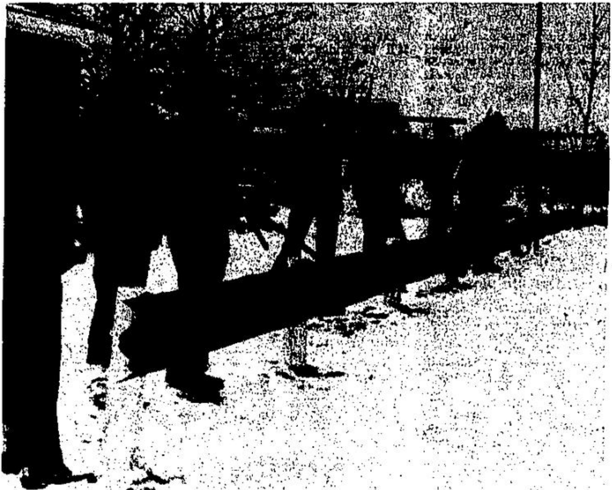
ALMOST 40 SHOOTERS turned out for the Guelph Rod and Gun Clubs monthly turkey shoot Sunday at Eden Mills. Shooters had a choice of two events, trap, or targets, in which to win a steak, ham, chicken, or turkey. This group is lined up on the target range.

Mixed bag The mixed bag of products includes bows, arrows and archery accessories, now in world demand since archery's entry into the Olympics; new material broadloom carpeting, in-ground metal and plastic swimming pools, in-plant food processing equipment, furniture hardware, washing machines and other appliances, miniature