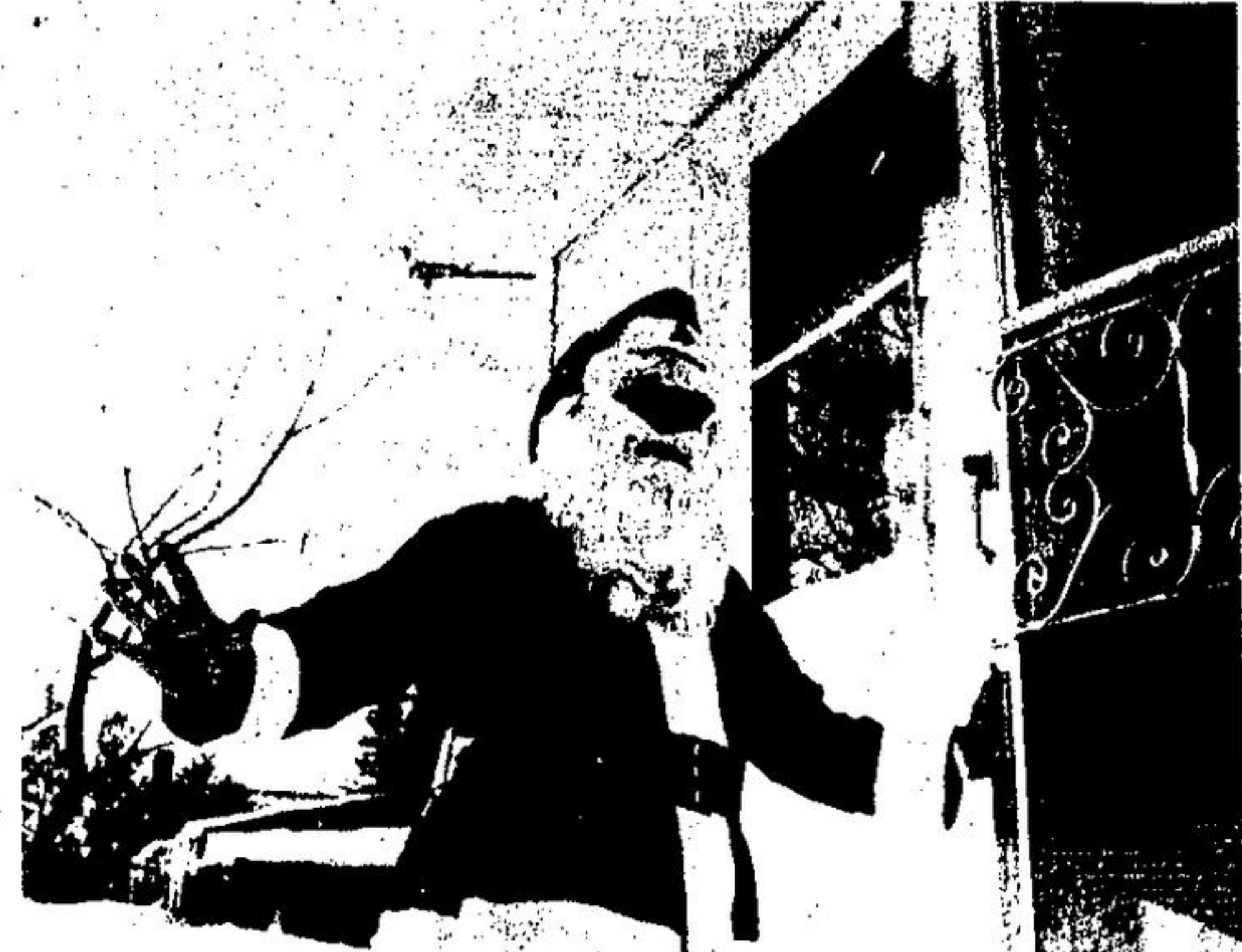
WITH A HO, HO, AND PONY CART, Santa arrived on Sunday for the Rockwood and Oustie Sunday School party at Sacred Heart rectory when 60 children and parents gathered to sing carols, view movies and talk Christmas, before refreshments and goodies culminated the annual celebration.