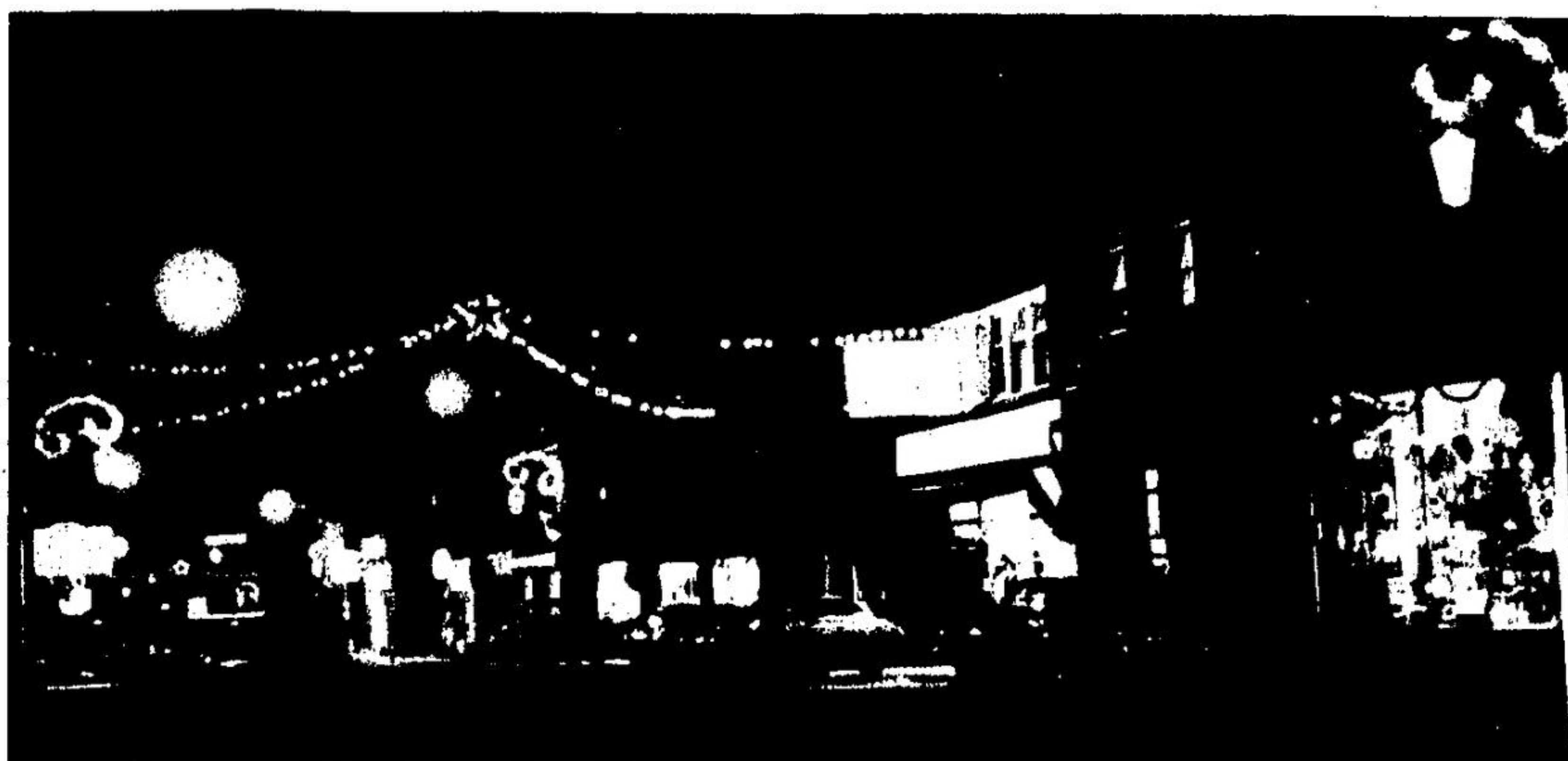
New Chamber of Commerce Christmas lighting brightens Acton's downtown business section.